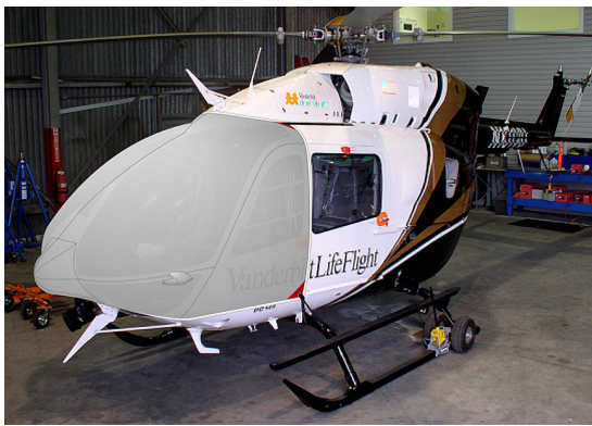
EC-145 Windshield/Nose Cover (illustration)