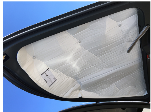
Eurocopter EC-145 Cockpit Heatshields