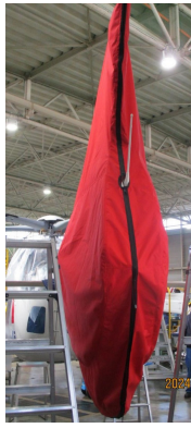
Airbus EC145 Tailfan Housing Fenestron Cover