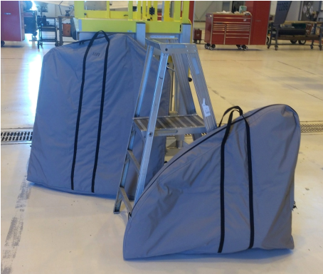
Eurocopter EC-145 Padded Bags for Removable Doors