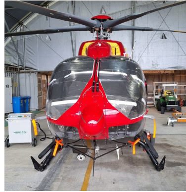
Airbus Helicopter H145D3 Windshield Heatshields, Engine Plugs