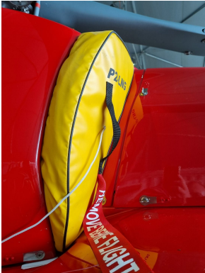
Airbus Helicopter H145D3 Intake Plugs

The Engine Inlet Plugs are custom fit for your Eurocopter EC-145, UH-145, BK-117 D-2 intakes, made with heavy-duty vinyl material, and stuffed with a single block of sculpted urethane foam. Each plug has a zipper that allows the foam to be removed and dried if necessary. Engine plugs have 'Remove Before Flight' streamers sewn onto the face of the plugs. Most plugs are imprinted with the aircraft registration number in black for an extra charge. Storage bag NOT included. Engine plugs may be inserted after flight when the engine is still warm. Engine Inlet Plugs are commonly referred to as Cowl Plugs, Intake Plugs, Cowl Blocks, Engine Blocks, and Engine Bungs.