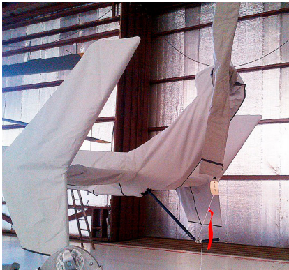
Tail Rotor Cover & Tailboom, Vertical Pylon & Stabilizers Cover

The Engine Inlet Plugs are custom fit for your Eurocopter EC-145, UH-145, BK-117 D-2 intakes, made with heavy-duty vinyl material, and stuffed with a single block of sculpted urethane foam. Each plug has a zipper that allows the foam to be removed and dried if necessary. Engine plugs have 'Remove Before Flight' streamers sewn onto the face of the plugs. Most plugs are imprinted with the aircraft registration number in black for an extra charge. Storage bag NOT included. Engine plugs may be inserted after flight when the engine is still warm. Engine Inlet Plugs are commonly referred to as Cowl Plugs, Intake Plugs, Cowl Blocks, Engine Blocks, and Engine Bungs.