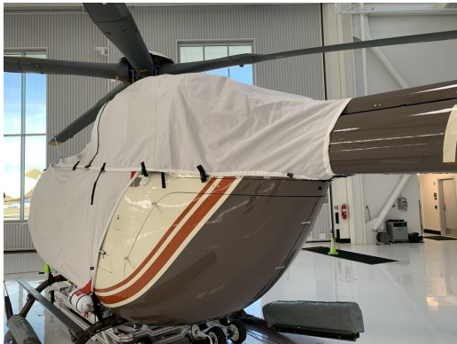
Eurocopter 145 Engine Area Cover, Bubble Cover

This cover type is made from Silver Acrylic Sunbrella canvas and is 100% lined with a soft and smooth microfiber. Bruce's Custom Covers developed this material combination especially for aircraft protection. The outer material is medium weight and treated for water resistance, UV resistance and anti-static buildup. The inner lining is a very soft and smooth microfiber to prevent scratching. The material is very reflective, and tests show that the cabin interior temperature can be reduced to near-ambient temperature on the hottest of days. It is water, ice and snow repellent, yet breathable to allow moisture to escape from between the cover and the aircraft surface.