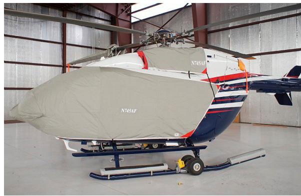
Bubble Cover w/ nose mounted radome, Upper Deck Plugs/Cover