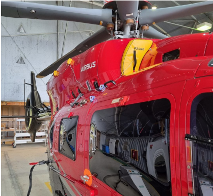
Airbus Helicopter H145D3 Intake Plugs