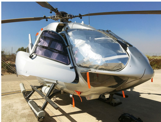
Eurocopter EC-145 Cockpit Heatshields

Heatshields are interior sunshades for an aircraft's windows or canopy glass. The product is a unique composite of closed-cell foam with a silver mylar finish. The semi-rigid design is stiff enough to stand along the inside of the windshield using sun visors or window framing. It folds up flat and easily stores in the included storage sleeve. Some designs may require velcro and suction cups. A Heatshield is an excellent short-term remedy for cockpit overheating.