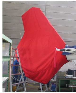
Airbus EC145 Tailfan Housing Fenestron Cover