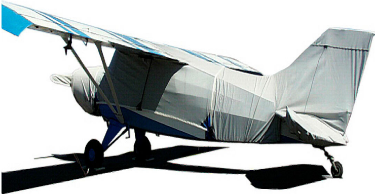
Maule Empennage, Engine & Prop Covers

WINTER USE MATERIAL - Made with Solution-Dyed Polyester fabric, this option is intended for seasonal use to aid in deicing, rain mitigation, or for occasional travel. The material is lighter and more compact, but more susceptible to UV damage and may have a shorter useful life if used continuously outside than the all-year use material.