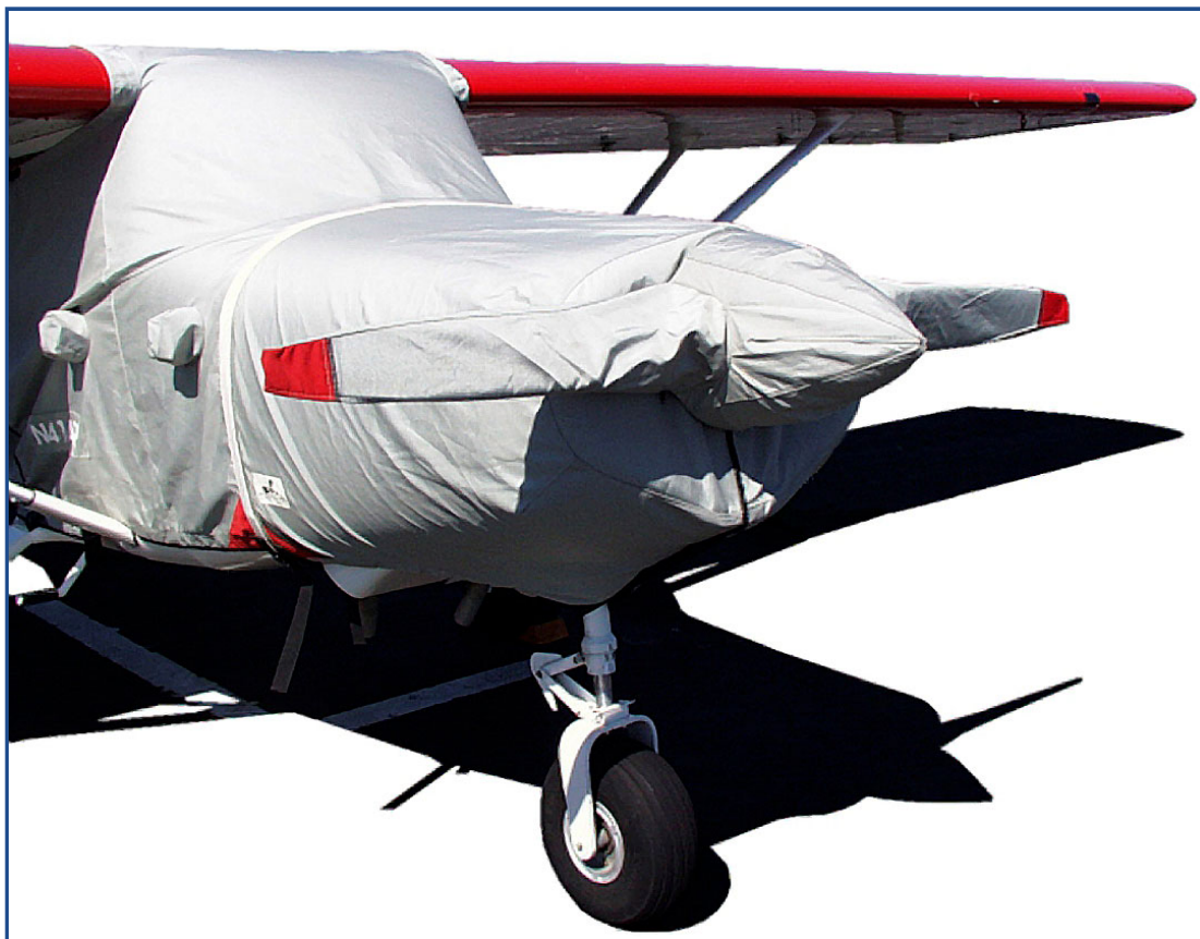
Maule Prop (2 Blade), Engine, &amp; Canopy Cover