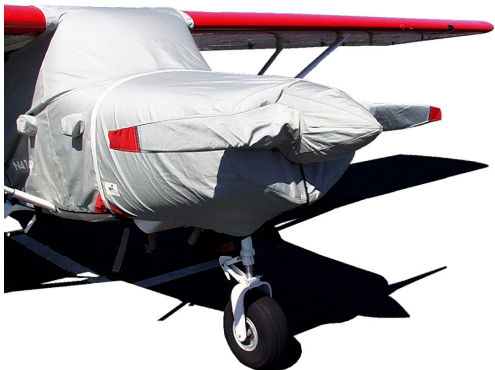
Maule Prop (2 Blade), Engine, & Canopy Cover