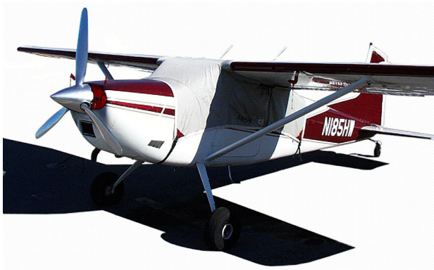
Cessna 185 Over-the-Top Canopy Cover

This cover type is made from Silver Acrylic Sunbrella canvas and is 100% lined with a soft and smooth microfiber. Bruce's Custom Covers developed this material combination especially for aircraft protection. The outer material is medium weight and treated for water resistance, UV resistance and anti-static buildup. The inner lining is a very soft and smooth microfiber to prevent scratching. The material is very reflective, and tests show that the cabin interior temperature can be reduced to near-ambient temperature on the hottest of days. It is water, ice and snow repellent, yet breathable to allow moisture to escape from between the cover and the aircraft surface.