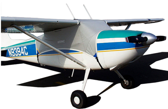
Cessna 180 Canopy Cover

This cover type is made from Silver Acrylic Sunbrella canvas and is 100% lined with a soft and smooth microfiber. Bruce's Custom Covers developed this material combination especially for aircraft protection. The outer material is medium weight and treated for water resistance, UV resistance and anti-static buildup. The inner lining is a very soft and smooth microfiber to prevent scratching. The material is very reflective, and tests show that the cabin interior temperature can be reduced to near-ambient temperature on the hottest of days. It is water, ice and snow repellent, yet breathable to allow moisture to escape from between the cover and the aircraft surface.