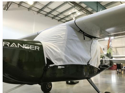
Vashon Ranger R7 Canopy Cover