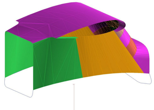
Glasair Aviation Glastar, Sportsman 2+2 Canopy Cover (Over-The-Top Style) Vashon R-7 Ranger Canopy Cover, 3D model