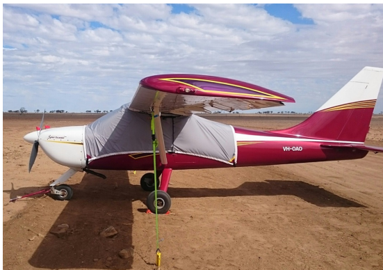
Glastar Sportsman Light Weight Travel Cover

Travel Covers are made with Silver Solution-Dyed Polyester fabric and only lined over the windshield to save weight. The material is lightweight and more compact for easy stowage in the aircraft. The polyester material is water resistant, but only intended for occasional use outside. We also have an ultra lightweight material available for fitted hangar dust covers. For daily outdoor use, the non-travel Sunbrella Cover is the best choice.