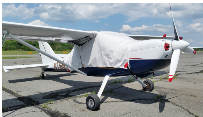
Glastar Over-Top Canopy Cover, Engine Plugs