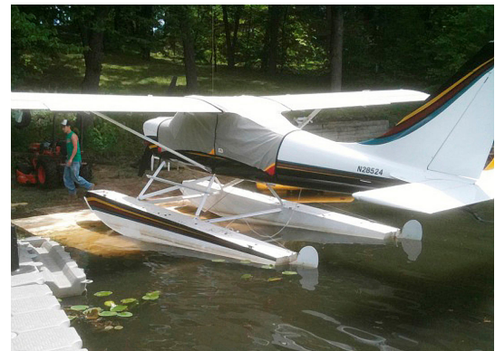
Glastar Sportsman Canopy Cover