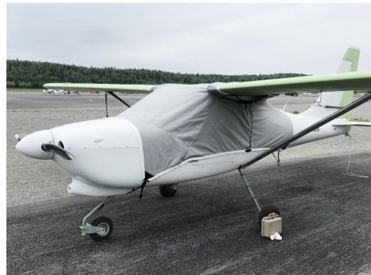
Glasair Aviation Glastar, Sportsman 2+2 Travel Cover, Light Weight Travel Canopy Cover