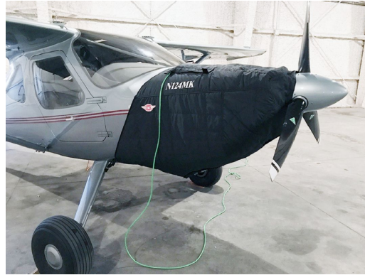
Glasair Aviation Glstar, Sportsman 2+2 Insulated Engine Cover