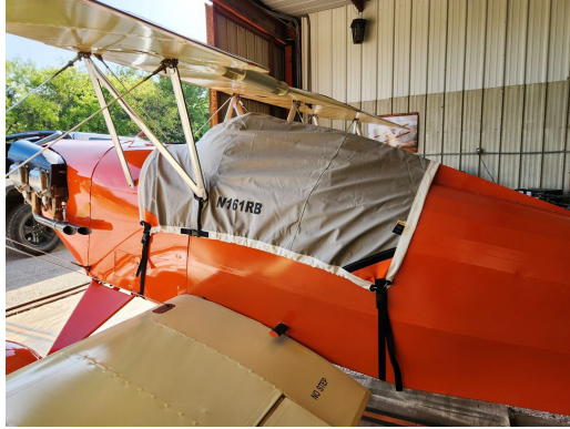
Burt Special Canopy Cover

This cover type is made from Silver Acrylic Sunbrella canvas and is 100% lined with a soft and smooth microfiber. Bruce's Custom Covers developed this material combination especially for aircraft protection. The outer material is medium weight and treated for water resistance, UV resistance and anti-static buildup. The inner lining is a very soft and smooth microfiber to prevent scratching. The material is very reflective, and tests show that the cabin interior temperature can be reduced to near-ambient temperature on the hottest of days. It is water, ice and snow repellent, yet breathable to allow moisture to escape from between the cover and the aircraft surface.