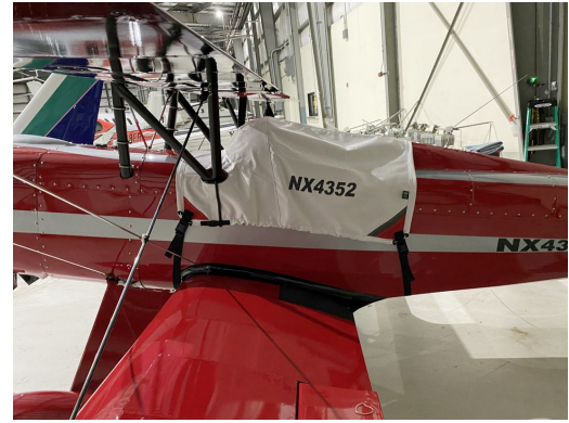
EAA Acro Sport Canopy Cover