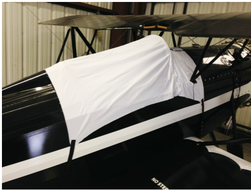
Rose Parrakeet Canopy Cover (test fit cover)

the hottest of days. It is water, ice and snow repellent, yet breathable to allow moisture to escape from between the cover and the aircraft surface.