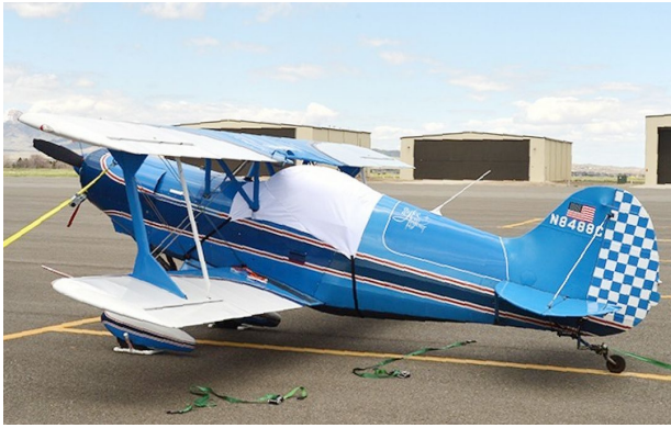
Acro Sport Canopy Cover

the hottest of days. It is water, ice and snow repellent, yet breathable to allow moisture to escape from between the cover and the aircraft surface.