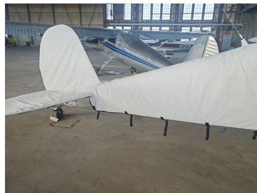
Cessna 140 Empennage Cover