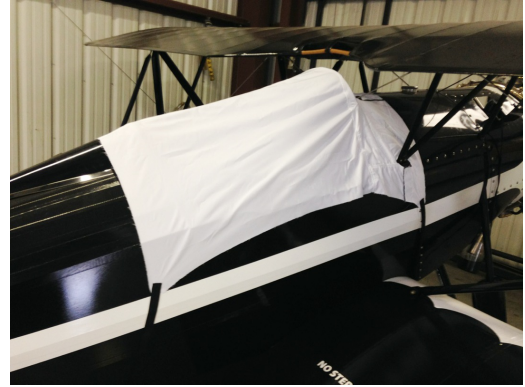
Rose Parrakeet Canopy Cover (test fit cover)