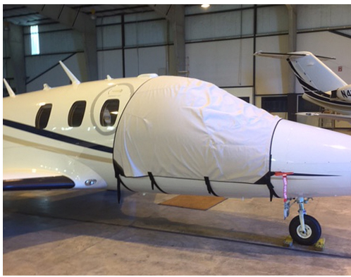
Eclipse Cockpit Door Cover, with Pitot Tube Covers

This cover type is made from Silver Acrylic Sunbrella canvas and is 100% lined with a soft and smooth microfiber. Bruce's Custom Covers developed this material combination especially for aircraft protection. The outer material is medium weight and treated for water resistance, UV resistance and anti-static buildup. The inner lining is a very soft and smooth microfiber to prevent scratching. The material is very reflective, and tests show that the cabin interior temperature can be reduced to near-ambient temperature on the hottest of days. It is water, ice and snow repellent, yet breathable to allow moisture to escape from between the cover and the aircraft surface.