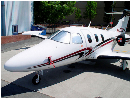
Eclipse Pitot Cover & Bikini Type Engine Covers