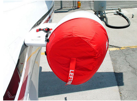
Eclipse Intake Cover & Pylon Wedge Plugs