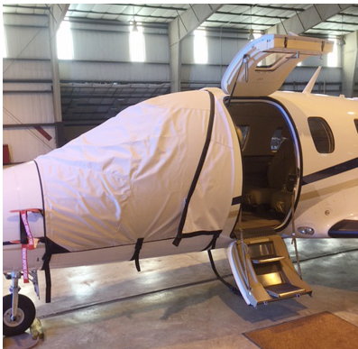
Eclipse Cockpit Door Cover, with Pitot Tube Covers

This cover type is made from Silver Acrylic Sunbrella canvas and is 100% lined with a soft and smooth microfiber. Bruce's Custom Covers developed this material combination especially for aircraft protection. The outer material is medium weight and treated for water resistance, UV resistance and anti-static buildup. The inner lining is a very soft and smooth microfiber to prevent scratching. The material is very reflective, and tests show that the cabin interior temperature can be reduced to near-ambient temperature on the hottest of days. It is water, ice and snow repellent, yet breathable to allow moisture to escape from between the cover and the aircraft surface.