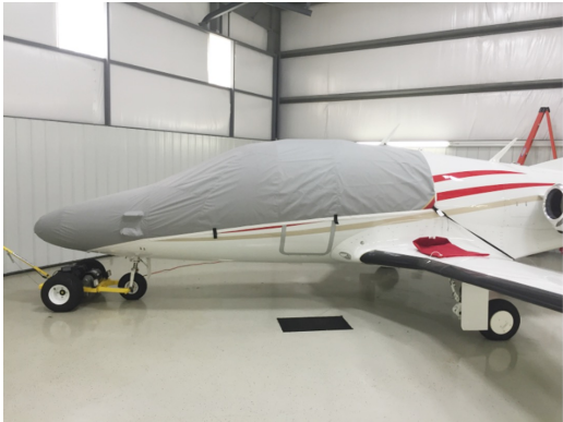
Eclipse Travel Weight Canopy/Nose Cover

This cover type is made from Silver Acrylic Sunbrella canvas and is 100% lined with a soft and smooth microfiber. Bruce's Custom Covers developed this material combination especially for aircraft protection. The outer material is medium weight and treated for water resistance, UV resistance and anti-static buildup. The inner lining is a very soft and smooth microfiber to prevent scratching. The material is very reflective, and tests show that the cabin interior temperature can be reduced to near-ambient temperature on the hottest of days. It is water, ice and snow repellent, yet breathable to allow moisture to escape from between the cover and the aircraft surface.