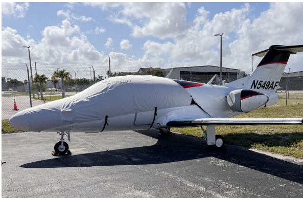
Eclipse EA500 Canopy/Nose Cover