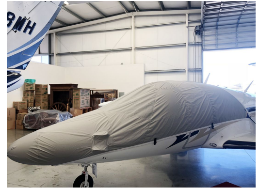
Customized to end before main antenna, with easy to use flat-hook straps. Eclipse EA500 Travel Weight Canopy/Nose Cover