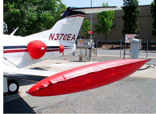
Eclipse Tip Tank & Engine Covers