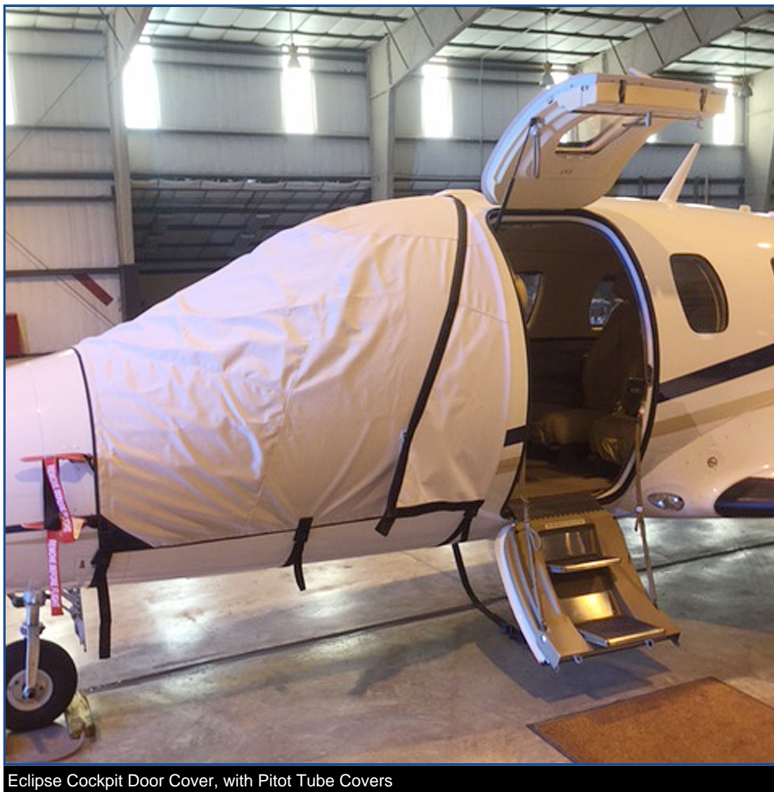
Eclipse Cockpit Door Cover, with Pitot Tube Covers