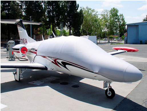
Eclipse Light Weight Travel Cover & Engine Plugs