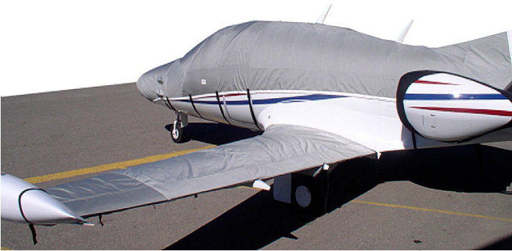
Fuselage Cover & Wing Covers with hail protection on all upper surfaces

WINTER USE MATERIAL - Made with Solution-Dyed Polyester fabric, this option is intended for seasonal use to aid in deicing, rain mitigation, or for occasional travel. The material is lighter and more compact, but more susceptible to UV damage and may have a shorter useful life if used continuously outside than the all-year use material.