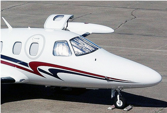
Eclipse Cockpit Heatshields

Cockpit Heatshields are interior sunshades for the aircraft's cockpit. The product is a unique composite of closed-cell foam with a silver mylar finish. The semi-rigid design is stiff enough to stand inside the window framing. The set folds up flat and is easily stored in the included storage sleeve. Some designs may require velcro and suction cups. Our Heatshields for jets are offered white side out because some aircraft manufacturers have issued advisories against reflective window inserts due to potential heat damage. A Heatshield is an excellent short-term remedy for cockpit overheating, but an external fabric cover is more effective for long-term protection.