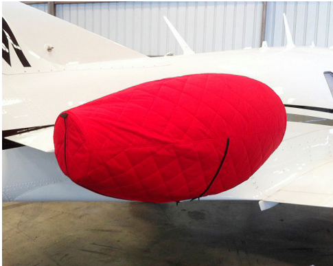
Eclipse Insulated Engine Cover