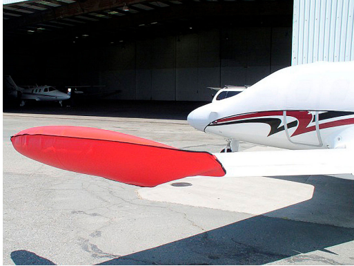
Eclipse Tip Tank Cover

Designed to prevent damage to the aircraft extremities in crowded hangars, these products are made of bright red Naugahyde and thickly padded with a sandwich of closed cell foam.