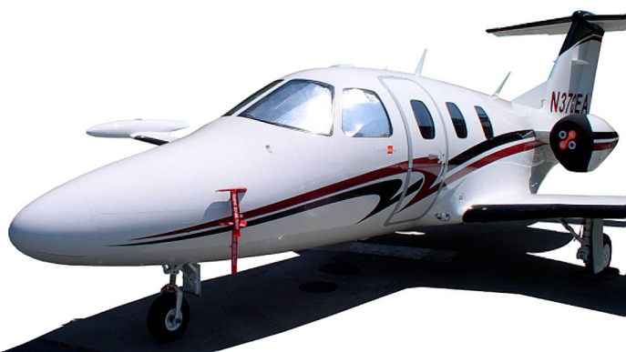
Cockpit HeatShields, Pitot Covers & "Bikini" style Engine Covers