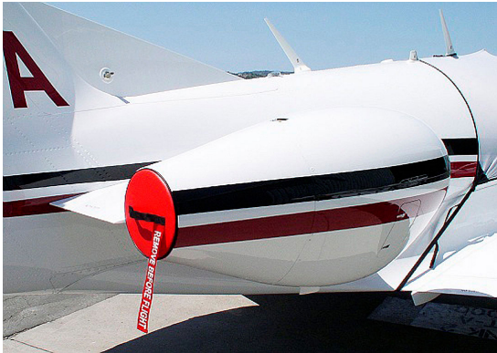
Eclipse Engine Exhaust Plugs set