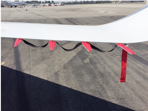
Citation X Static Wick Protectors

necessary. Engine plugs have 'remove before flight' streamers sewn onto the face of the plugs. Most plugs are imprinted with the aircraft registration number in black for an extra charge. Storage bag NOT included. Engine plugs may be inserted after flight when the engine is still warm. Engine Inlet Plugs are commonly referred to as Cowl Plugs, Intake Plugs, Cowl Blocks, Engine Blocks, and Engine Bungs.