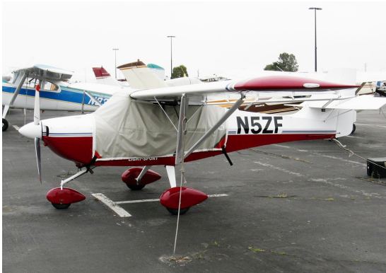
Eurofox Canopy Cover

This cover type is made from Silver Acrylic Sunbrella canvas and is 100% lined with a soft and smooth microfiber. Bruce's Custom Covers developed this material combination especially for aircraft protection. The outer material is medium weight and treated for water resistance, UV resistance and anti-static buildup. The inner lining is a very soft and smooth microfiber to prevent scratching. The material is very reflective, and tests show that the cabin interior temperature can be reduced to near-ambient temperature on the hottest of days. It is water, ice and snow repellent, yet breathable to allow moisture to escape from between the cover and the aircraft surface.