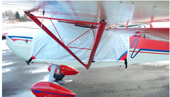
Kitfox IV Over-the-top Canopy Cover