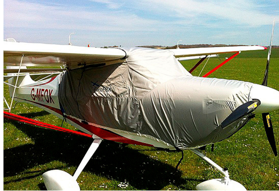
EuroFox and Aerotrek A240 Lightweight Travel Canopy/Engine Cover