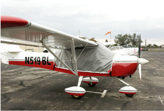
EUROFOX Light Weight Travel Canopy Cover

Travel Covers are made with Silver Solution-Dyed Polyester fabric and only lined over the windshield to save weight. The material is lightweight and more compact for easy stowage in the aircraft. The polyester material is water resistant, but only intended for occasional use outside. We also have an ultra lightweight material available for fitted hangar dust covers. For daily outdoor use, the non-travel Sunbrella Cover is the best choice.