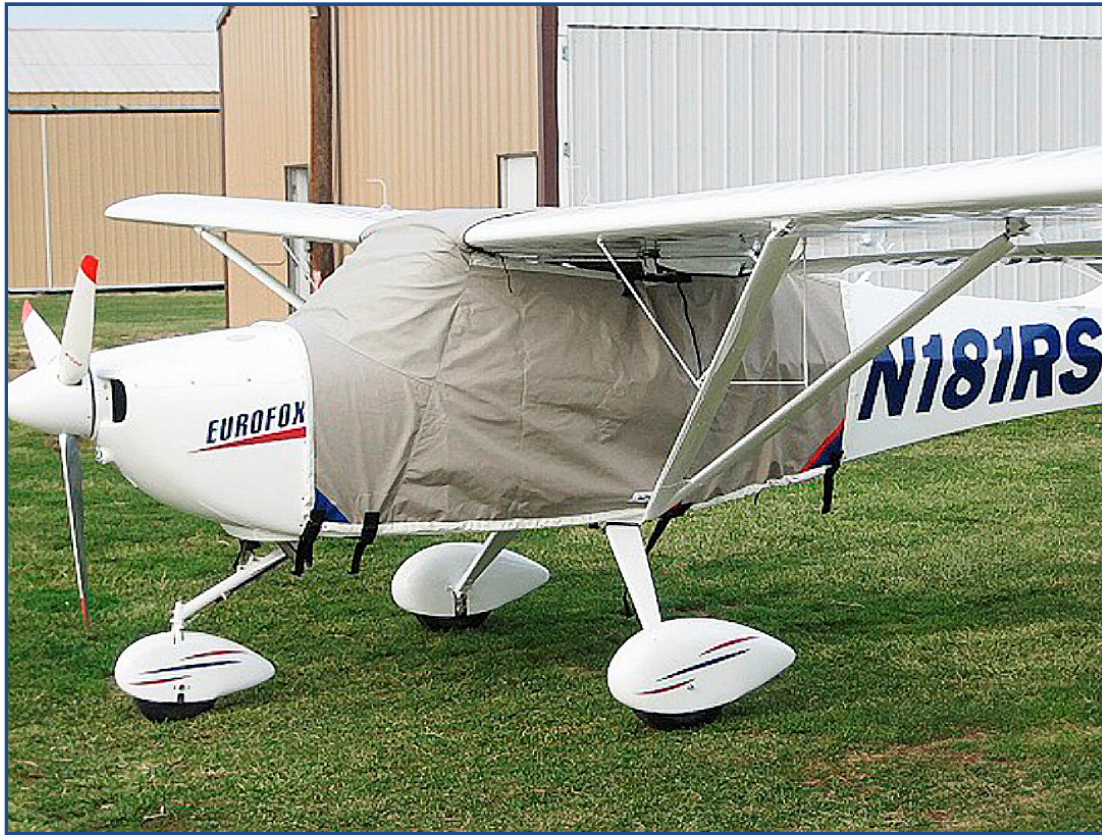
Eurofox LSA Extended Canopy Cover (same as an Aerotrek)