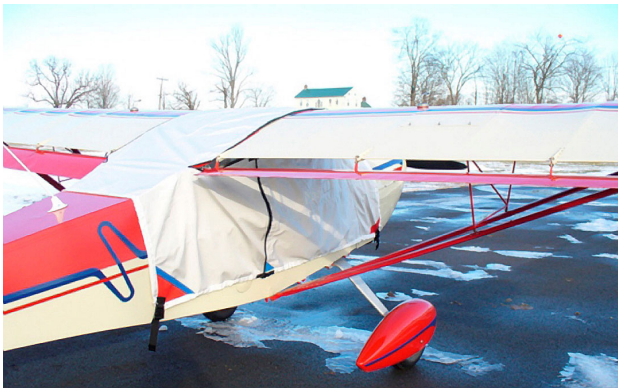
Kitfox IV Over-the-top Canopy Cover

This cover type is made from Silver Acrylic Sunbrella canvas and is 100% lined with a soft and smooth microfiber. Bruce's Custom Covers developed this material combination especially for aircraft protection. The outer material is medium weight and treated for water resistance, UV resistance and anti-static buildup. The inner lining is a very soft and smooth microfiber to prevent scratching. The material is very reflective, and tests show that the cabin interior temperature can be reduced to near-ambient temperature on the hottest of days. It is water, ice and snow repellent, yet breathable to allow moisture to escape from between the cover and the aircraft surface.