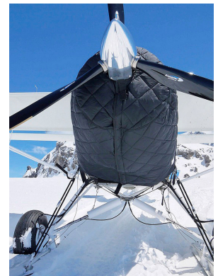
FOR INTERIOR USE. Cub Crafters CC-11 Insulated Hangar Blanket, available in Red or Silver Kitfox Insulated Engine Cover