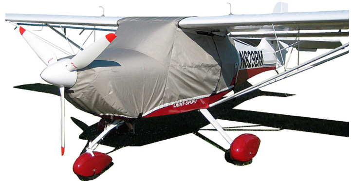
Aerotrek A240 Canopy/Engine Cover