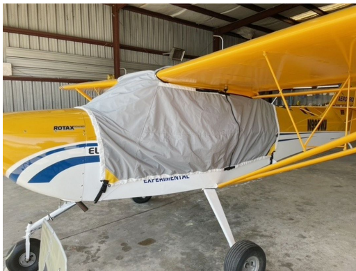
Eurofox Travel Weight Canopy Cover

Travel Covers are made with Silver Solution-Dyed Polyester fabric and only lined over the windshield to save weight. The material is lightweight and more compact for easy stowage in the aircraft. The polyester material is water resistant, but only intended for occasional use outside. We also have an ultra lightweight material available for fitted hangar dust covers. For daily outdoor use, the non-travel Sunbrella Cover is the best choice.