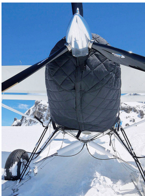
Kitfox Insulated Engine Cover

This cover type is made from Silver Acrylic Sunbrella canvas and is 100% lined with a soft and smooth microfiber. Bruce's Custom Covers developed this material combination especially for aircraft protection. The outer material is medium weight and treated for water resistance, UV resistance and anti-static buildup. The inner lining is a very soft and smooth microfiber to prevent scratching. The material is very reflective, and tests show that the cabin interior temperature can be reduced to near-ambient temperature on the hottest of days. It is water, ice and snow repellent, yet breathable to allow moisture to escape from between the cover and the aircraft surface.