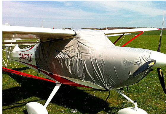
EuroFox and Aerotrek A240 Lightweight Travel Canopy/Engine Cover