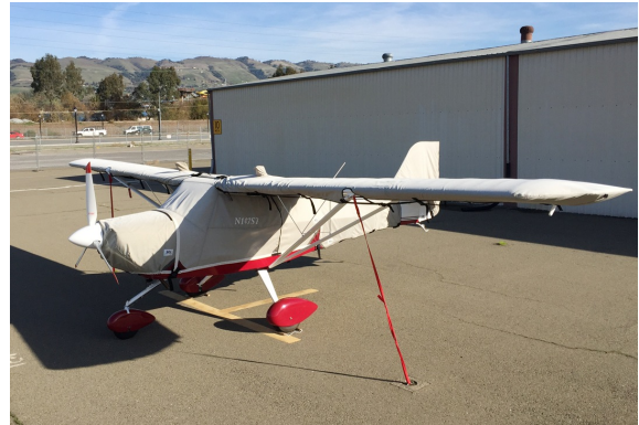
Eurofox Canopy, Engine, Wings and Empennage Covers