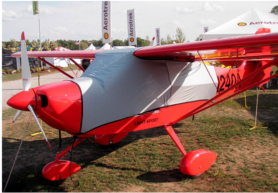
Aerotrek A240 Spandex FlyAway Travel Canopy Cover

Travel Covers are made with Silver Solution-Dyed Polyester fabric and only lined over the windshield to save weight. The material is lightweight and more compact for easy stowage in the aircraft. The polyester material is water resistant, but only intended for occasional use outside. We also have an ultra lightweight material available for fitted hangar dust covers. For daily outdoor use, the non-travel Sunbrella Cover is the best choice.