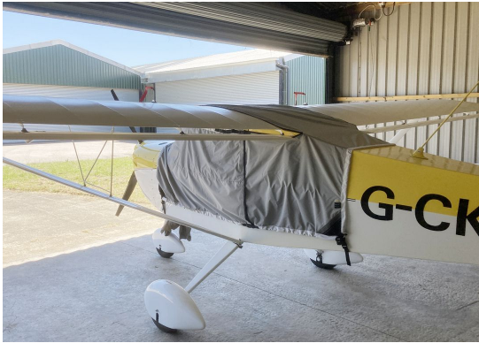
Eurofox Travel Canopy Cover