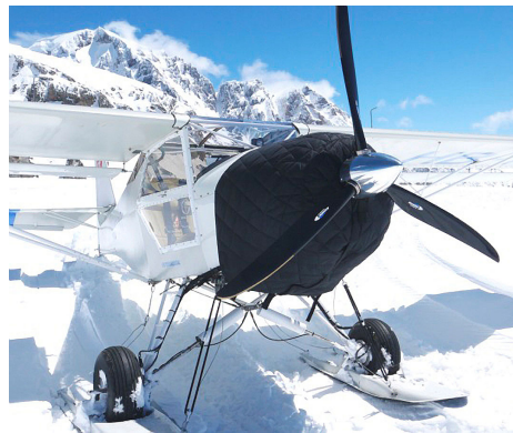
Kitfox Insulated Engine Cover