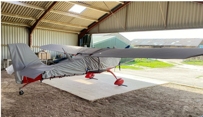
Eurofox Complete Cover Set

WINTER USE MATERIAL - Made with Solution-Dyed Polyester fabric, this option is intended for seasonal use to aid in deicing, rain mitigation, or for occasional travel. The material is lighter and more compact, but more susceptible to UV damage and may have a shorter useful life if used continuously outside than the all-year use material.