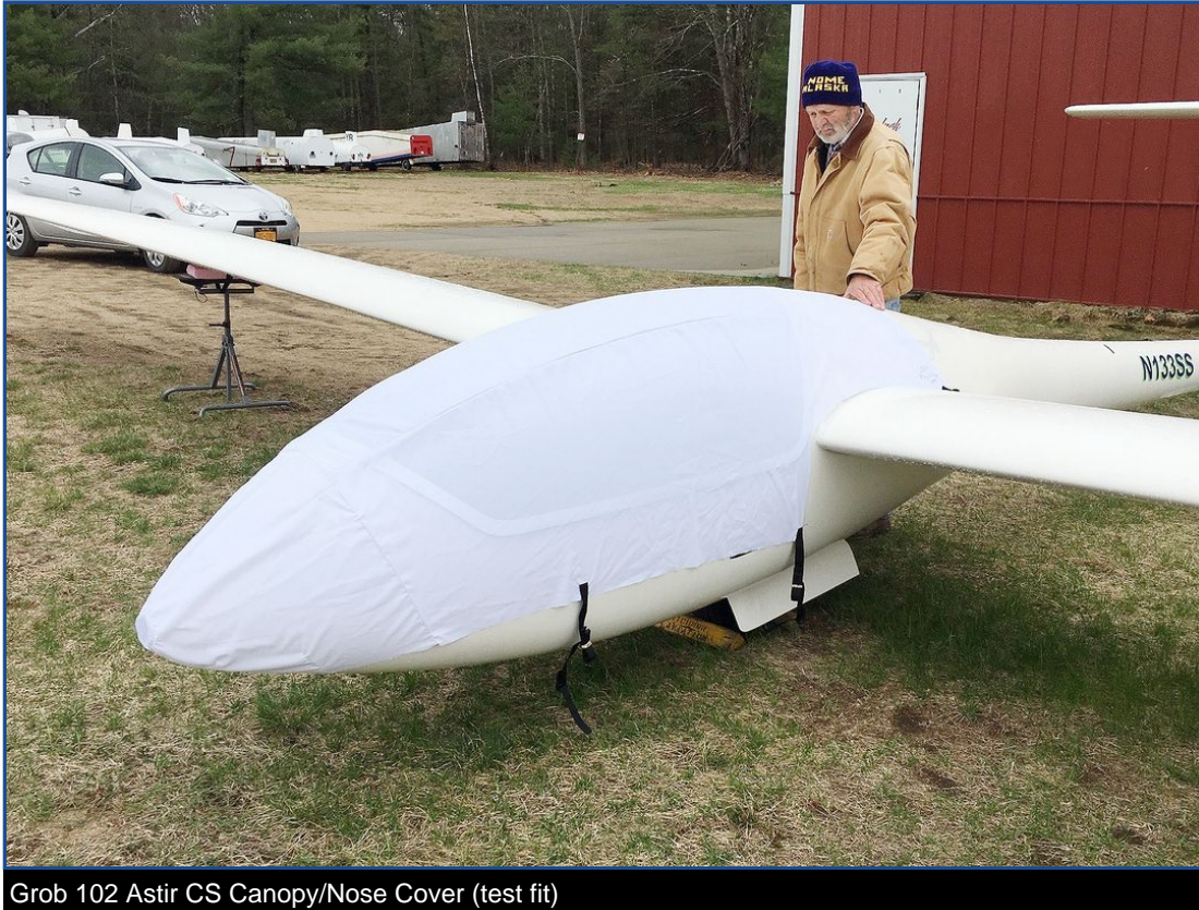
Grob 102 Astir CS Canopy/Nose Cover (test fit)