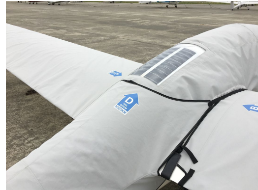
DG-505 Full Cover Set