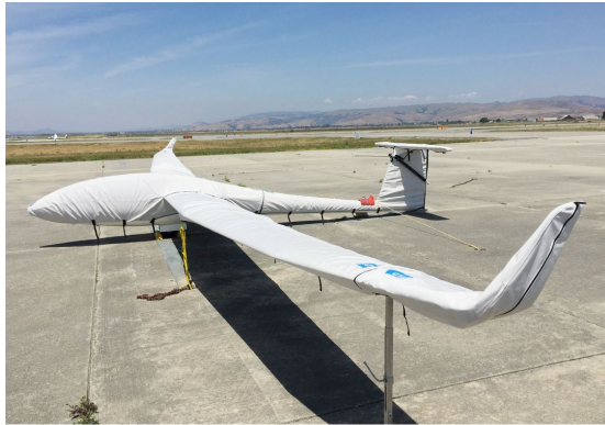
Schempp-Hirth Discus 2B Full Cover Set

WINTER USE MATERIAL - Made with Solution-Dyed Polyester fabric, this option is intended for seasonal use to aid in deicing, rain mitigation, or for occasional travel. The material is lighter and more compact, but more susceptible to UV damage and may have a shorter useful life if used continuously outside than the all-year use material.