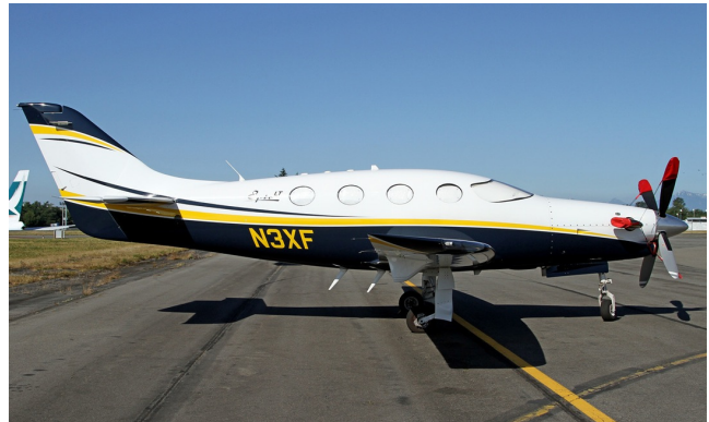
Epic LT Cockpit & Cabin HeatShields