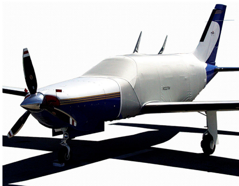
Piper Malibu/Mirage/Meridian Extended Canopy Cover

This cover type is made from Silver Acrylic Sunbrella canvas and is 100% lined with a soft and smooth microfiber. Bruce's Custom Covers developed this material combination especially for aircraft protection. The outer material is medium weight and treated for water resistance, UV resistance and anti-static buildup. The inner lining is a very soft and smooth microfiber to prevent scratching. The material is very reflective, and tests show that the cabin interior temperature can be reduced to near-ambient temperature on the hottest of days. It is water, ice and snow repellent, yet breathable to allow moisture to escape from between the cover and the aircraft surface.