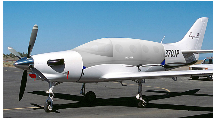
Epic LT Canopy Cover & Engine Plugs