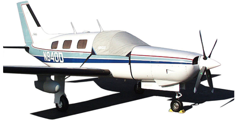
Piper Malibu/Mirage Windshield Cover