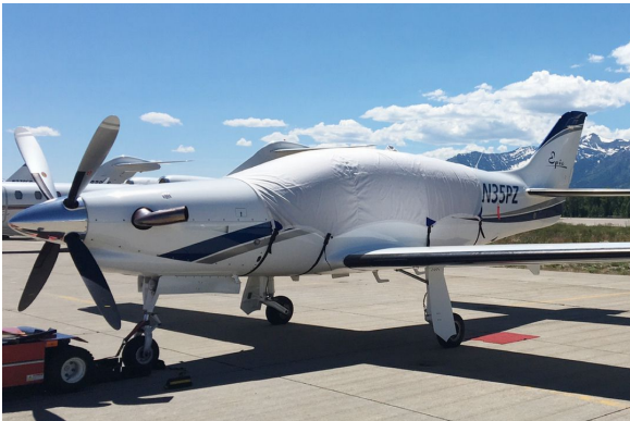
Epic LT Canopy Cover

This cover type is made from Silver Acrylic Sunbrella canvas and is 100% lined with a soft and smooth microfiber. Bruce's Custom Covers developed this material combination especially for aircraft protection. The outer material is medium weight and treated for water resistance, UV resistance and anti-static buildup. The inner lining is a very soft and smooth microfiber to prevent scratching. The material is very reflective, and tests show that the cabin interior temperature can be reduced to near-ambient temperature on the hottest of days. It is water, ice and snow repellent, yet breathable to allow moisture to escape from between the cover and the aircraft surface.