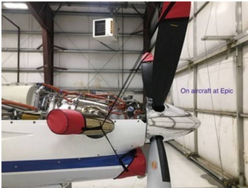
Epic Aircraft Prop Tie, Exhaust & Intake Covers

This cover type is made from Silver Acrylic Sunbrella canvas and is 100% lined with a soft and smooth microfiber. Bruce's Custom Covers developed this material combination especially for aircraft protection. The outer material is medium weight and treated for water resistance, UV resistance and anti-static buildup. The inner lining is a very soft and smooth microfiber to prevent scratching. The material is very reflective, and tests show that the cabin interior temperature can be reduced to near-ambient temperature on the hottest of days. It is water, ice and snow repellent, yet breathable to allow moisture to escape from between the cover and the aircraft surface.