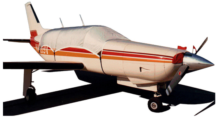
Malibu/Mirage/Meridian Standard Canopy Cover