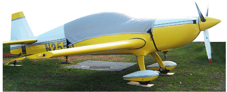
Extra 300L Canopy Cover