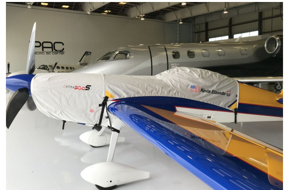
Extra 300S Canopy & Engine Covers