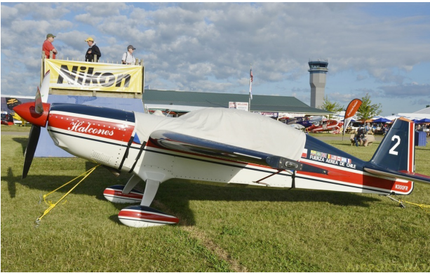
Extra 300 (mid-fuselage wing) Canopy Cover

This cover type is made from Silver Acrylic Sunbrella canvas and is 100% lined with a soft and smooth microfiber. Bruce's Custom Covers developed this material combination especially for aircraft protection. The outer material is medium weight and treated for water resistance, UV resistance and anti-static buildup. The inner lining is a very soft and smooth microfiber to prevent scratching. The material is very reflective, and tests show that the cabin interior temperature can be reduced to near-ambient temperature on the hottest of days. It is water, ice and snow repellent, yet breathable to allow moisture to escape from between the cover and the aircraft surface.