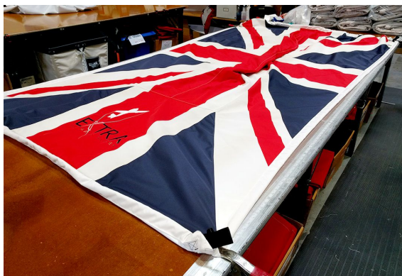
Custom Full-Cover Artwork