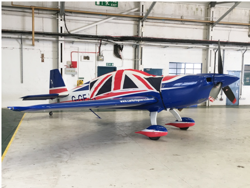
Extra 330 Canopy Cover, custom design

This cover type is made from Silver Acrylic Sunbrella canvas and is 100% lined with a soft and smooth microfiber. Bruce's Custom Covers developed this material combination especially for aircraft protection. The outer material is medium weight and treated for water resistance, UV resistance and anti-static buildup. The inner lining is a very soft and smooth microfiber to prevent scratching. The material is very reflective, and tests show that the cabin interior temperature can be reduced to near-ambient temperature on the hottest of days. It is water, ice and snow repellent, yet breathable to allow moisture to escape from between the cover and the aircraft surface.