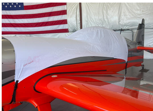
Extra NG Canopy Cover, Single Place Model, test fit cover

This cover type is made from Silver Acrylic Sunbrella canvas and is 100% lined with a soft and smooth microfiber. Bruce's Custom Covers developed this material combination especially for aircraft protection. The outer material is medium weight and treated for water resistance, UV resistance and anti-static buildup. The inner lining is a very soft and smooth microfiber to prevent scratching. The material is very reflective, and tests show that the cabin interior temperature can be reduced to near-ambient temperature on the hottest of days. It is water, ice and snow repellent, yet breathable to allow moisture to escape from between the cover and the aircraft surface.