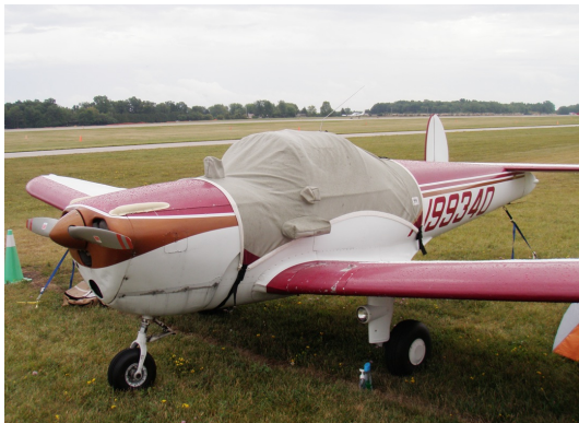
Ercoupe Canopy Cover, bubble windshield model

This cover type is made from Silver Acrylic Sunbrella canvas and is 100% lined with a soft and smooth microfiber. Bruce's Custom Covers developed this material combination especially for aircraft protection. The outer material is medium weight and treated for water resistance, UV resistance and anti-static buildup. The inner lining is a very soft and smooth microfiber to prevent scratching. The material is very reflective, and tests show that the cabin interior temperature can be reduced to near-ambient temperature on the hottest of days. It is water, ice and snow repellent, yet breathable to allow moisture to escape from between the cover and the aircraft surface.