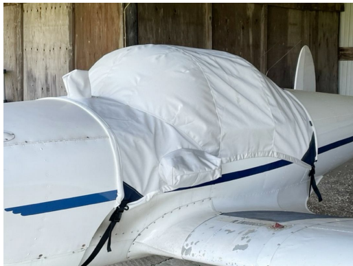
ERCOUPE 415-C Canopy Cover

This cover type is made from Silver Acrylic Sunbrella canvas and is 100% lined with a soft and smooth microfiber. Bruce's Custom Covers developed this material combination especially for aircraft protection. The outer material is medium weight and treated for water resistance, UV resistance and anti-static buildup. The inner lining is a very soft and smooth microfiber to prevent scratching. The material is very reflective, and tests show that the cabin interior temperature can be reduced to near-ambient temperature on the hottest of days. It is water, ice and snow repellent, yet breathable to allow moisture to escape from between the cover and the aircraft surface.