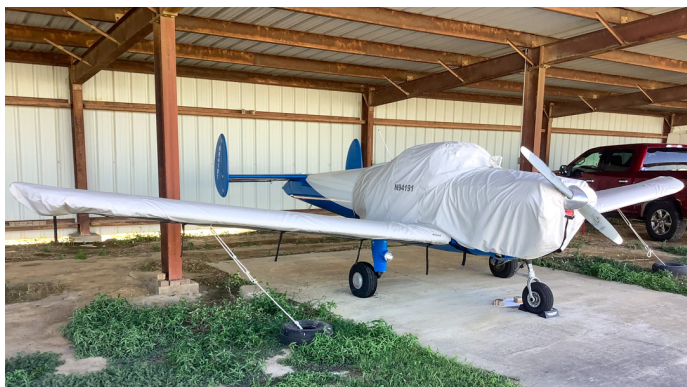
Ercoupe 415-C Wing Covers, All Year Use(set of 2)

WINTER USE MATERIAL - Made with Solution-Dyed Polyester fabric, this option is intended for seasonal use to aid in deicing, rain mitigation, or for occasional travel. The material is lighter and more compact, but more susceptible to UV damage and may have a shorter useful life if used continuously outside than the all-year use material.