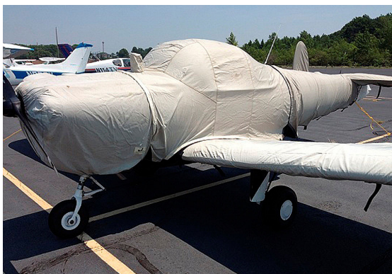
Ercoupe full cover set: Extended Canopy, Engine, Wing & Empennage covers

WINTER USE MATERIAL - Made with Solution-Dyed Polyester fabric, this option is intended for seasonal use to aid in deicing, rain mitigation, or for occasional travel. The material is lighter and more compact, but more susceptible to UV damage and may have a shorter useful life if used continuously outside than the all-year use material.