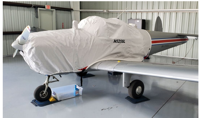
Ercoupe 415-C Extended Canopy/Engine Cover