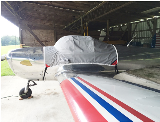
Ercoupe Light Weight Travel Cover

Travel Covers are made with Silver Solution-Dyed Polyester fabric and only lined over the windshield to save weight. The material is lightweight and more compact for easy stowage in the aircraft. The polyester material is water resistant, but only intended for occasional use outside. We also have an ultra lightweight material available for fitted hangar dust covers. For daily outdoor use, the non-travel Sunbrella Cover is the best choice.