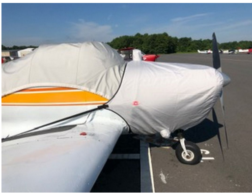
Ercoupe 415-C Fully Enclosed Engine Cover