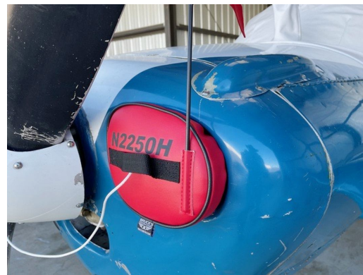
Ercoupe Engine Plugs