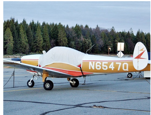
Alon Ercoupe Canopy Cover