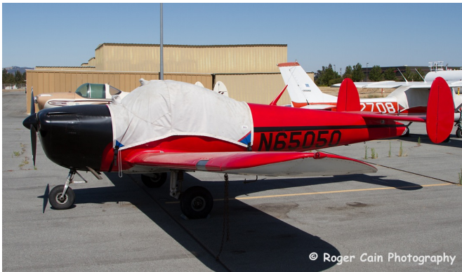
Ercoupe Canopy Cover

Travel Covers are made with Silver Solution-Dyed Polyester fabric and only lined over the windshield to save weight. The material is lightweight and more compact for easy stowage in the aircraft. The polyester material is water resistant, but only intended for occasional use outside. We also have an ultra lightweight material available for fitted hangar dust covers. For daily outdoor use, the non-travel Sunbrella Cover is the best choice.