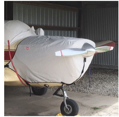
Ercoupe Engine Cover