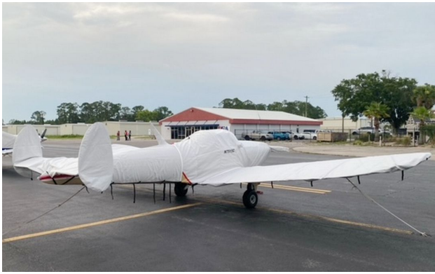
Ercoupe Complete Cover Set