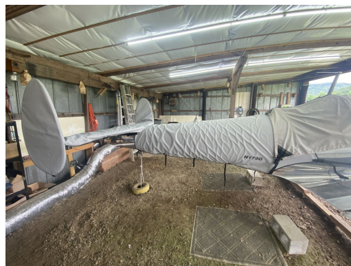
Ercoupe Empennage Cover