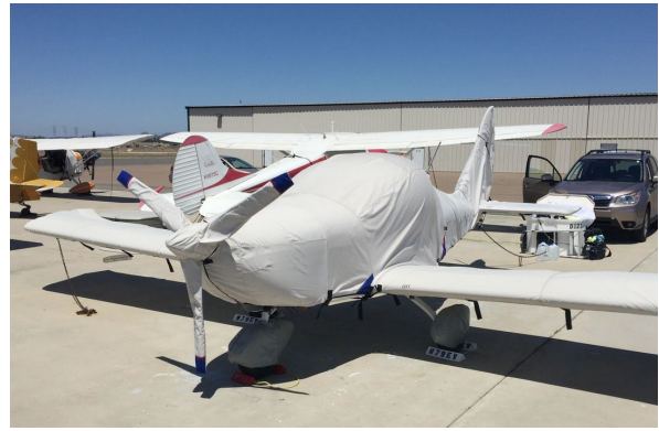
2017 Evektor Sportstar Max All Year Use Wing Covers