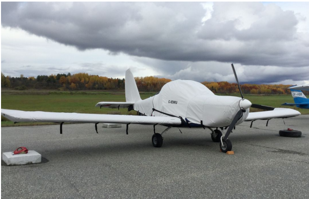
Evektor Sportstar Full Cover Set