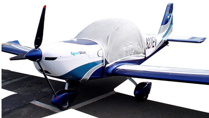
Evektor Sportstar Standard Canopy Cover

This cover type is made from Silver Acrylic Sunbrella canvas and is 100% lined with a soft and smooth microfiber. Bruce's Custom Covers developed this material combination especially for aircraft protection. The outer material is medium weight and treated for water resistance, UV resistance and anti-static buildup. The inner lining is a very soft and smooth microfiber to prevent scratching. The material is very reflective, and tests show that the cabin interior temperature can be reduced to near-ambient temperature on the hottest of days. It is water, ice and snow repellent, yet breathable to allow moisture to escape from between the cover and the aircraft surface.