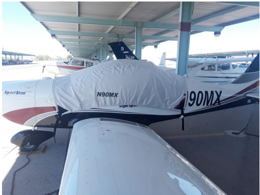
Evektor Sportstar Max Canopy Cover