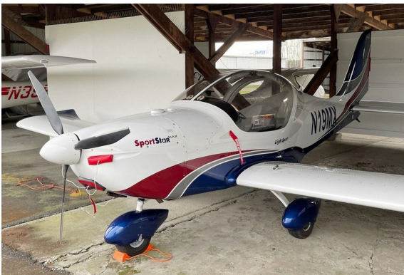
Evektor SportStar Engine & Vent Plugs

Engine Inlet Plugs are custom fit for your Evektor-Aerotechnik SportStar, Eurostar, Max, Harmony intakes, made with heavy-duty vinyl material, and stuffed with a single block of sculpted urethane foam. Each plug has a zipper that allows the foam to be removed and dried if necessary. Engine plugs have warning flags that are visible from the cockpit or 'remove before flight' streamers sewn onto the face of the plugs. Most plugs are imprinted with the aircraft registration number in black for an extra charge. Storage bag NOT included. Engine plugs may be inserted after flight when the engine is still warm. Engine Inlet Plugs are commonly referred to as Cowl Plugs, Intake Plugs, Cowl Blocks, Engine Blocks, and Engine Bungs.