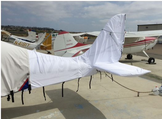
Evektor SportStar, Eurostar, Max Empennage Cover, test fit cover.

shorter useful life if used continuously outside than the all-year use material.