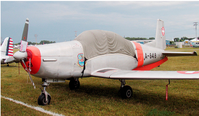
Piaggio P-149D Trainer Canopy Cover