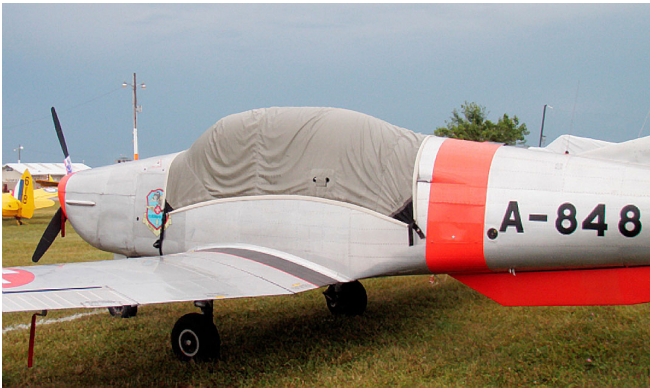
Piaggio P-149D Trainer Canopy Cover

of the Canopy Cover and Engine Cover. This cover will enclose the engine cowl and will extend aft to cover all of the windows. This cover type is made from Silver Acrylic Sunbrella canvas and is 100% lined with a soft and smooth microfiber. Bruce's Custom Covers developed this material combination especially for aircraft protection. The outer material is medium weight and treated for water resistance, UV resistance and anti-static buildup. The inner lining is a very soft and smooth microfiber to prevent scratching. The material is very reflective, and tests show that the cabin interior temperature can be reduced to near-ambient temperature on the hottest of days. It is water, ice and snow repellent, yet breathable to allow moisture to escape from between the cover and the aircraft surface.