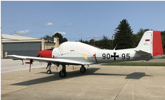
Focke Wulf F149 Canopy Cover, Wing Covers

of the Canopy Cover and Engine Cover. This cover will enclose the engine cowl and will extend aft to cover all of the windows. This cover type is made from Silver Acrylic Sunbrella canvas and is 100% lined with a soft and smooth microfiber. Bruce's Custom Covers developed this material combination especially for aircraft protection. The outer material is medium weight and treated for water resistance, UV resistance and anti-static buildup. The inner lining is a very soft and smooth microfiber to prevent scratching. The material is very reflective, and tests show that the cabin interior temperature can be reduced to near-ambient temperature on the hottest of days. It is water, ice and snow repellent, yet breathable to allow moisture to escape from between the cover and the aircraft surface.