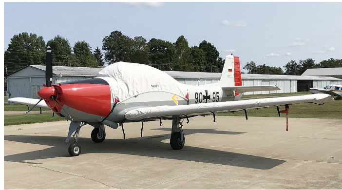
Focke Wulf F149 Canopy Cover, Wing Covers, Engine Plugs

Engine Inlet Plugs are custom fit for your Focke Wulf FW9.149D Trainer intakes, made with heavy-duty vinyl material, and stuffed with a single block of sculpted urethane foam. Each plug has a zipper that allows the foam to be removed and dried if necessary. Engine plugs have warning flags that are visible from the cockpit or 'remove before flight' streamers sewn onto the face of the plugs. Most plugs are imprinted with the aircraft registration number in black for an extra charge. Storage bag NOT included. Engine plugs may be inserted after flight when the engine is still warm. Engine Inlet Plugs are commonly referred to as Cowl Plugs, Intake Plugs, Cowl Blocks, Engine Blocks, and Engine Bungs.