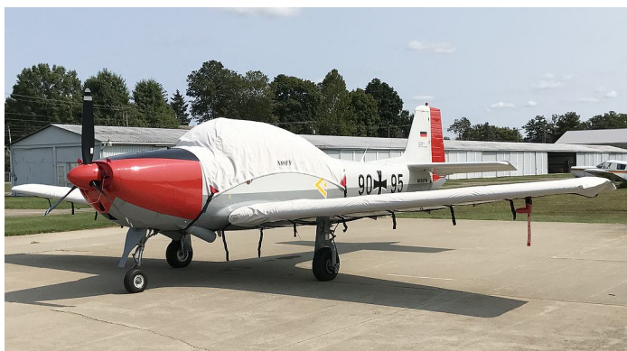
Focke Wulf F149 Canopy Cover, Wing Covers, Engine Plugs

WINTER USE MATERIAL - Made with Solution-Dyed Polyester fabric, this option is intended for seasonal use to aid in deicing, rain mitigation, or for occasional travel. The material is lighter and more compact, but more susceptible to UV damage and may have a shorter useful life if used continuously outside than the all-year use material.