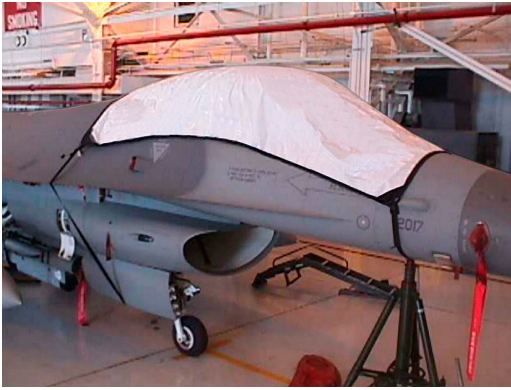
F-16 "Blackout" type Canopy Cover

Canopy Covers are commonly referred to as Cabin Covers, Fuselage Covers, Canvas Covers, Canopy Caps, etc.