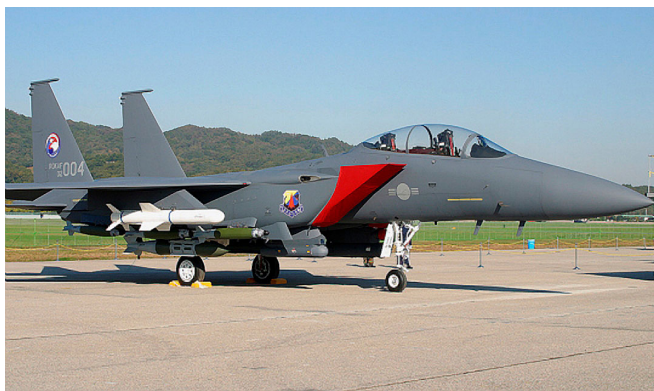
Intake Cover, F15-K

The McDonnell Douglas F-15 Eagle Intake Covers are designed to install easily yet be completely storable. A spring steel hoop is sewn into the hem of each cover, allowing them to be installed without climbing onto the wing or using a stepladder. To store the covers the spring steel hoop folds like a band-saw blade into three nesting rings. Each cover folds into a compact circular bundle which is stored in the included duffel bag, yet they unfold quickly for use. The Tri-Fold Ring cover is made of medium weight nylon which is available in a variety of colors to match the paint trim. Each cover set comes complete with installation and folding instructions. The aircraft's registration number can be silkscreened onto the cover for an extra charge.