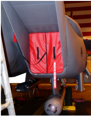
F15 Intake Plugs

The Engine Inlet Plugs are custom fit for your McDonnell Douglas F-15 Eagle intakes, made with heavy-duty vinyl material, and stuffed with a single block of sculpted urethane foam. Each plug has a zipper that allows the foam to be removed and dried if necessary. Engine plugs have 'remove before flight' streamers sewn onto the face of the plugs. Most plugs are imprinted with the aircraft registration number in black for an extra charge. Storage bag NOT included. Engine plugs may be inserted after flight when the engine is still warm. Engine Inlet Plugs are commonly referred to as Cowl Plugs, Intake Plugs, Cowl Blocks, Engine Blocks, and Engine Bungs.