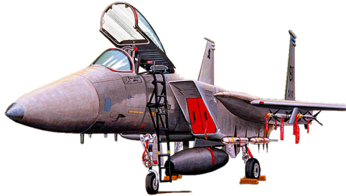
F15 Cockpit HeatShields & Intake Plugs