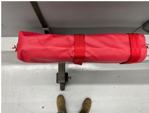
McDonnell Douglas F-15 Launcher Rail Cover

ALL-YEAR USE MATERIAL - Made with Silver Acrylic Sunbrella canvas, the all-year use material is the best option for sun protection and cover longevity. This heavier more durable material is intended for all weather conditions, such as rain and snow or lots of sun.