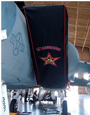
F15 Intake Cover

The McDonnell Douglas F-15 Eagle Intake Covers are designed to install easily yet be completely storable. A spring steel hoop is sewn into the hem of each cover, allowing them to be installed without climbing onto the wing or using a stepladder. To store the covers the spring steel hoop folds like a band-saw blade into three nesting rings. Each cover folds into a compact circular bundle which is stored in the included duffle bag, yet they unfold quickly for use. The Tri-Fold Ring cover is made of medium weight nylon which is available in a variety of colors to match the paint trim. Each cover set comes complete with installation and folding instructions. The aircraft's registration number can be silkscreened onto the cover for an extra charge.