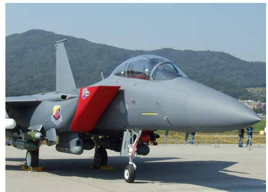
McDonnell Douglas F-15 Eagle Engine Inlet Covers