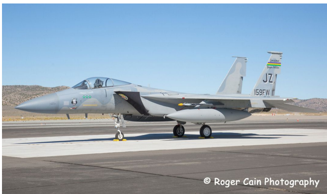
McDonnell-Douglas F-15 Intake Covers

The McDonnell Douglas F-15 Eagle Intake Covers are designed to install easily yet be completely storable. A spring steel hoop is sewn into the hem of each cover, allowing them to be installed without climbing onto the wing or using a stepladder. To store the covers the spring steel hoop folds like a band-saw blade into three nesting rings. Each cover folds into a compact circular bundle which is stored in the included duffle bag, yet they unfold quickly for use. The Tri-Fold Ring cover is made of medium weight nylon which is available in a variety of colors to match the paint trim. Each cover set comes complete with installation and folding instructions. The aircraft's registration number can be silkscreened onto the cover for an extra charge.