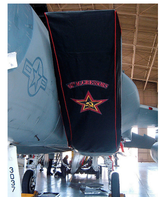
F15 Intake Cover