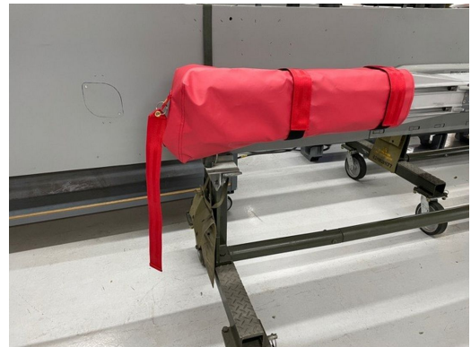
McDonnell Douglas F-15 Launcher Rail Cover