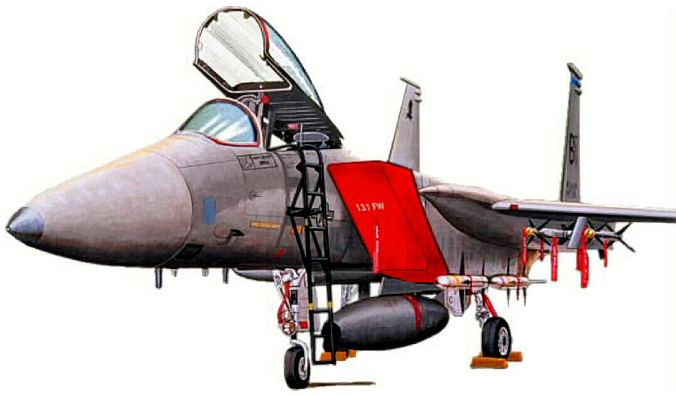
F15 Cockpit HeatShields & Inlet Cover