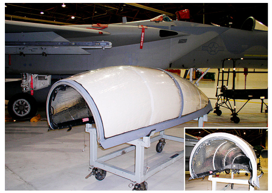
F-15 Cockpit HeatShield