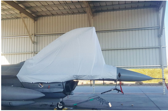
McDonnell Douglas F16-D Canopy Cover, open cockpit type (test fit cover)

Canopy Covers are commonly referred to as Cabin Covers, Fuselage Covers, Canvas Covers, Canopy Caps, etc.