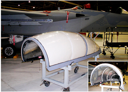
F-15 Cockpit HeatShield

Heatshields are interior sunshades for an aircraft's windows or canopy glass. The product is a unique composite of closed-cell foam with a silver mylar finish. The semi-rigid design is stiff enough to stand along the inside of the windshield using sun visors or window framing. It folds up flat and easily stores in the included storage sleeve. Some designs may require velcro and suction cups. A Heatshield is an excellent short-term remedy for cockpit overheating.