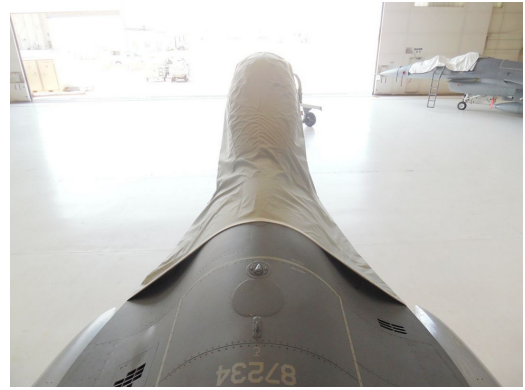
F-16 CANOPY COVER, OPEN POSITION (C-Model, single seat models)