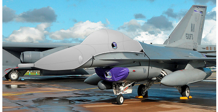
F-16 Canopy/Nose Cover