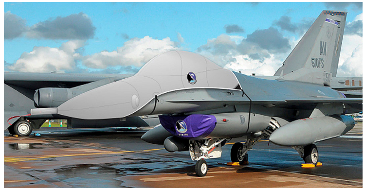
F-16 Canopy/Nose Cover