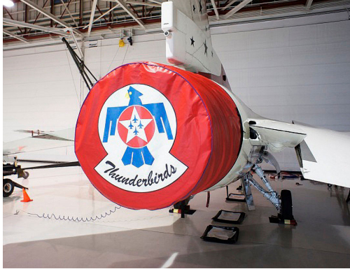
F-16 Radome, Pitot, Air Data Probe Cover, Intake Cover, HUD Cover, Seat Cover

The General Dynamics F-16 Fighting Falcon Intake Covers are designed to install easily yet be completely storable. A spring steel hoop is sewn into the hem of each cover, allowing them to be installed without climbing onto the wing or using a stepladder. To store the covers the spring steel hoop folds like a band-saw blade into three nesting rings. Each cover folds into a compact circular bundle which is stored in the included duffle bag, yet they unfold quickly for use. The Tri-Fold Ring cover is made of medium weight nylon which is available in a variety of colors to match the paint trim. Each cover set comes complete with installation and folding instructions. The aircraft's registration number can be silkscreened onto the cover for an extra charge.