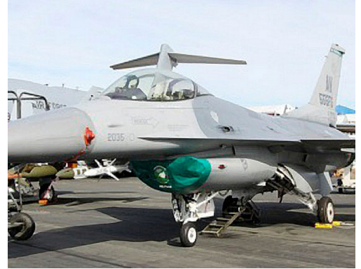
F-16 Intake Cover