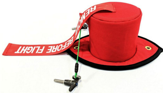
General Dynamics F-16 AOA Probe Cover

The Engine Inlet Plugs are custom fit for your General Dynamics F-16 Fighting Falcon intakes, made with heavy-duty vinyl material, and stuffed with a single block of sculpted urethane foam. Each plug has a zipper that allows the foam to be removed and dried if necessary. Engine plugs have 'remove before flight' streamers sewn onto the face of the plugs. Most plugs are imprinted with the aircraft registration number in black for an extra charge. Storage bag NOT included. Engine plugs may be inserted after flight when the engine is still warm. Engine Inlet Plugs are commonly referred to as Cowl Plugs, Intake Plugs, Cowl Blocks, Engine Blocks, and Engine Bungs.