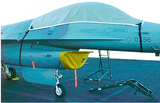
Canopy Cover, F-16

Travel Covers are made with Silver Solution-Dyed Polyester fabric and only lined over the windshield to save weight. The material is lightweight and more compact for easy stowage in the aircraft. The polyester material is water resistant, but only intended for occasional use outside. We also have an ultra lightweight material available for fitted hangar dust covers. For daily outdoor use, the non-travel Sunbrella Cover is the best choice.