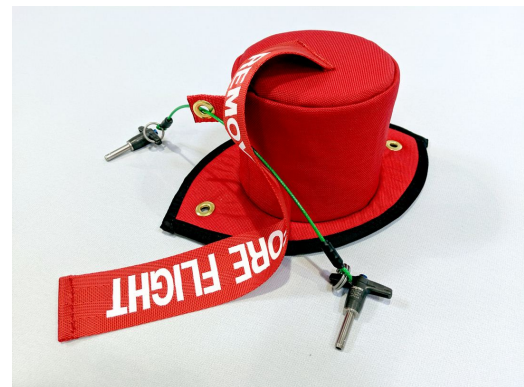
General Dynamics F-16 AOA Probe Cover