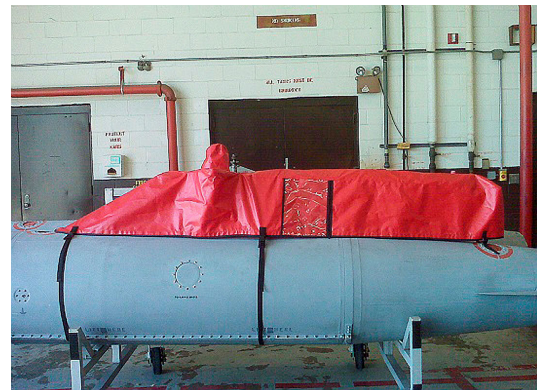
370 gal. WING FUEL TANK PYLON COVER, with/without forms pouch