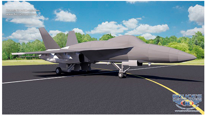
F-18 Storage Covers, 3D rendering