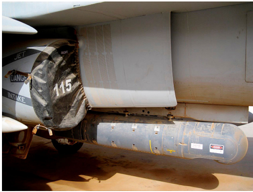
F-18 Intake Covers

The McDonnell Douglas F-18 Hornet, Super Hornet Intake Covers are designed to install easily yet be completely storable. A spring steel hoop is sewn into the hem of each cover, allowing them to be installed without climbing onto the wing or using a stepladder. To store the covers the spring steel hoop folds like a band-saw blade into three nesting rings. Each cover folds into a compact circular bundle which is stored in the included duffle bag, yet they unfold quickly for use. The Tri-Fold Ring cover is made of medium weight nylon which is available in a variety of colors to match the paint trim. Each cover set comes complete with installation and folding instructions. The aircraft's registration number can be silkscreened onto the cover for an extra charge.