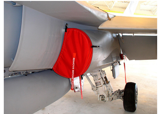
F-18 Engine Inlet Cover