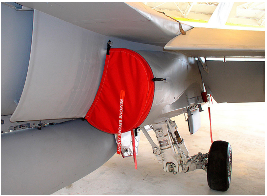
F-18 Engine Inlet Cover