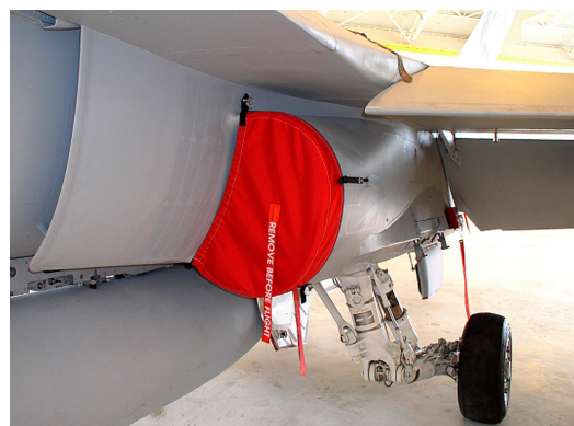
F-18 Engine Inlet Cover