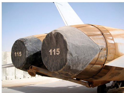
F-18 Exhaust Covers

The McDonnell Douglas F-18 Hornet, Super Hornet Intake Covers are designed to install easily yet be completely storable. A spring steel hoop is sewn into the hem of each cover, allowing them to be installed without climbing onto the wing or using a stepladder. To store the covers the spring steel hoop folds like a band-saw blade into three nesting rings. Each cover folds into a compact circular bundle which is stored in the included duffle bag, yet they unfold quickly for use. The Tri-Fold Ring cover is made of medium weight nylon which is available in a variety of colors to match the paint trim. Each cover set comes complete with installation and folding instructions. The aircraft's registration number can be silkscreened onto the cover for an extra charge.