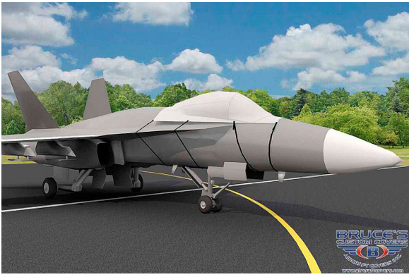
F-18 Canopy Cover, illustration