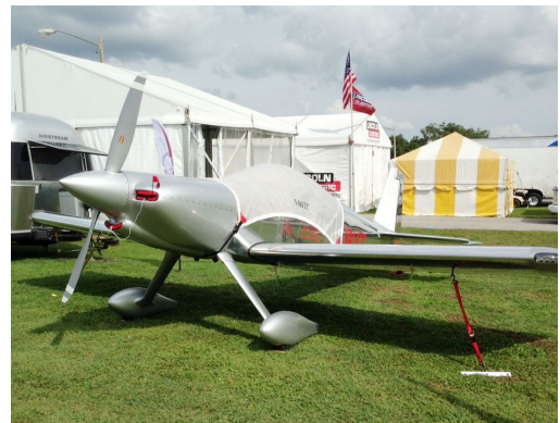
F1 Rocket Canopy Cover, Engine Plugs