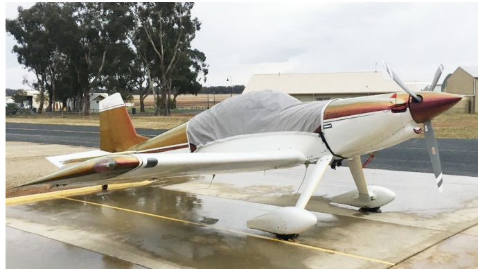
F1 Rocket Engine Plugs too small to imprint on plugs