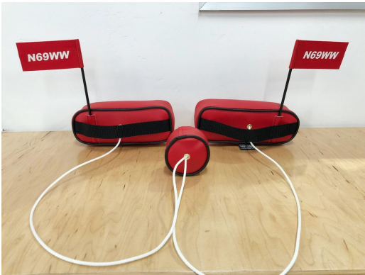
F1 Rocket Engine Plugs too small to imprint on plugs

Engine Inlet Plugs are custom fit for your Team Rocket F1 Rocket, F4 Raider intakes, made with heavy-duty vinyl material, and stuffed with a single block of sculpted urethane foam. Each plug has a zipper that allows the foam to be removed and dried if necessary. Engine plugs have warning flags that are visible from the cockpit or 'remove before flight' streamers sewn onto the face of the plugs. Most plugs are imprinted with the aircraft registration number in black for an extra charge. Storage bag NOT included. Engine plugs may be inserted after flight when the engine is still warm. Engine Inlet Plugs are commonly referred to as Cowl Plugs, Intake Plugs, Cowl Blocks, Engine Blocks, and Engine Bungs.