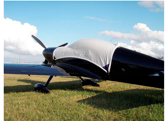
Harmon Rocket Canopy Cover