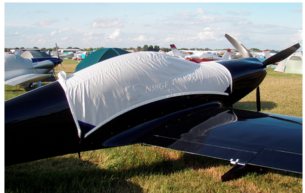
F1 Rocket Canopy Cover