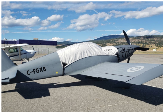
F1 Rocket Canopy Cover

This cover type is made from Silver Acrylic Sunbrella canvas and is 100% lined with a soft and smooth microfiber. Bruce's Custom Covers developed this material combination especially for aircraft protection. The outer material is medium weight and treated for water resistance, UV resistance and anti-static buildup. The inner lining is a very soft and smooth microfiber to prevent scratching. The material is very reflective, and tests show that the cabin interior temperature can be reduced to near-ambient temperature on the hottest of days. It is water, ice and snow repellent, yet breathable to allow moisture to escape from between the cover and the aircraft surface.