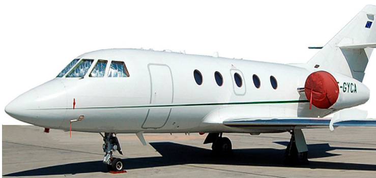
Falcon Engine Cover & Cockpit HeatShields

Cockpit Heatshields are interior sunshades for the aircraft's cockpit. The product is a unique composite of closed-cell foam with a silver mylar finish. The semi-rigid design is stiff enough to stand inside the window framing. The set folds up flat and is easily stored in the included storage sleeve. Some designs may require velcro and suction cups. Our Heatshields for jets are offered white side out because some aircraft manufacturers have issued advisories against reflective window inserts due to potential heat damage. A Heatshield is an excellent short-term remedy for cockpit overheating, but an external fabric cover is more effective for long-term protection.