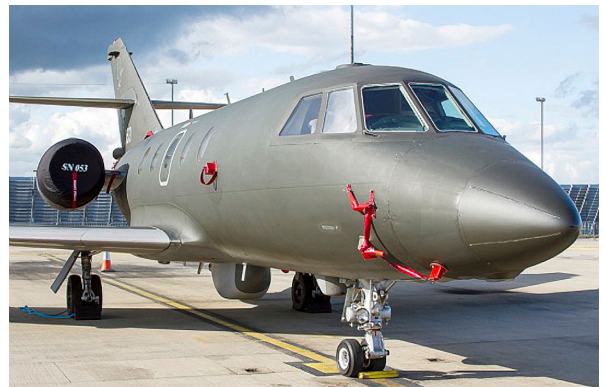
Falcon Engine Covers (not our probe covers)