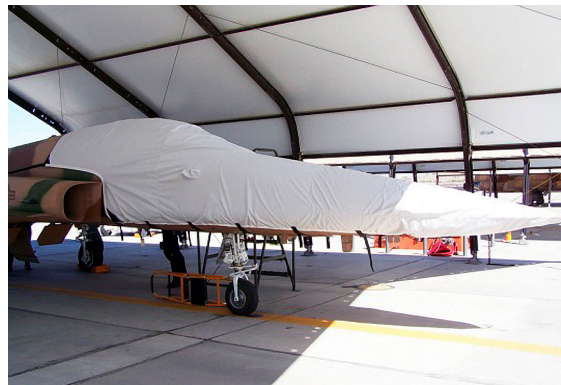
Northrup F-5 Talon Canopy/Nose Cover