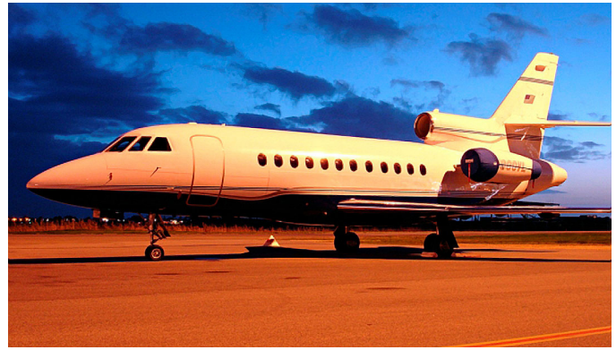
Falcon 900 Engine Covers