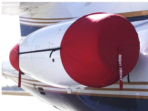
Falcon 50EX Outboard Intake/Exhaust Covers

The Falcon Jet 50EX Bikini Style Engine Covers are a single-piece design using a soft and smooth stretchy and fabric. The cover stretches tightly over both the intake and exhaust, installing quickly and easily. These covers are designed to be used as hangar dust covers and have a useful life of approximately one year.