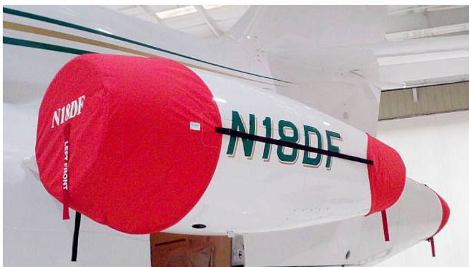
Falcon 900 Engine Cover Set

The Falcon Jet 50EX Bikini Style Engine Covers are a single-piece design using a soft and smooth stretchy and fabric. The cover stretches tightly over both the intake and exhaust, installing quickly and easily. These covers are designed to be used as hangar dust covers and have a useful life of approximately one year.