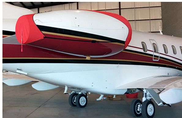
Intake/Exhaust Covers, 3-Strap Type. Successfully installed by two crew, one ladder.