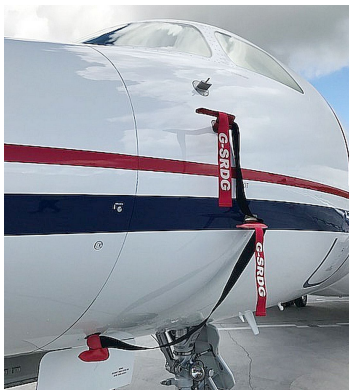
Falcon Jet 7X Pitot Probe/Aoa Set, Heat Resistant Type

The Engine Inlet Plugs are custom fit for your Falcon Jet 6X intakes, made with heavy-duty vinyl material, and stuffed with a single block of sculpted urethane foam. Each plug has a zipper that allows the foam to be removed and dried if necessary. Engine plugs have 'remove before flight' streamers sewn onto the face of the plugs. Most plugs are imprinted with the aircraft registration number in black for an extra charge. Storage bag NOT included. Engine plugs may be inserted after flight when the engine is still warm. Engine Inlet Plugs are commonly referred to as Cowl Plugs, Intake Plugs, Cowl Blocks, Engine Blocks, and Engine Bungs.