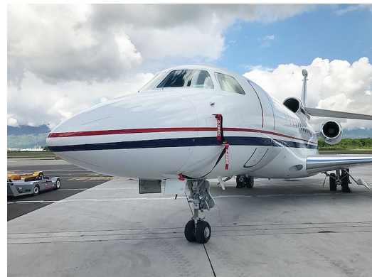
Falcon Jet 7X Pitot Probe/Aoa Set, Heat Resistant Type