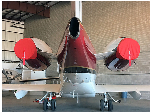
Canadair Challenger 300 Intake/Exhaust Covers, 3-Strap Type