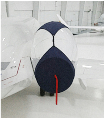
Challenger 300 Intake/Exhaust Cover Set, 3-strap type

The Falcon Jet 6X Bikini Style Engine Covers are a single-piece design using a soft and smooth stretchy and fabric. The cover stretches tightly over both the intake and exhaust, installing quickly and easily. These covers are designed to be used as hangar dust covers and have a useful life of approximately one year.