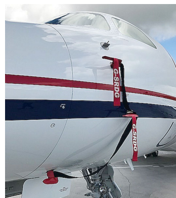
Falcon Jet 7X Pitot Probe/Aoa Set, Heat Resistant Type