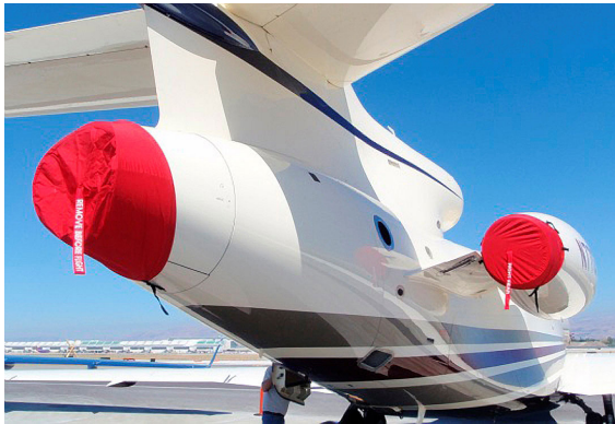
Falcon 7X Exhaust Covers

The Falcon Jet 7X Intake Covers are designed to install easily yet be completely storable. A spring steel hoop is sewn into the hem of each cover, allowing them to be installed without climbing onto the wing or using a stepladder. To store the covers the spring steel hoop folds like a band-saw blade into three nesting rings. Each cover folds into a compact circular bundle which is stored in the included duffle bag, yet they unfold quickly for use. The Tri-Fold Ring cover is made of medium weight nylon which is available in a variety of colors to match the paint trim. Each cover set comes complete with installation and folding instructions. The aircraft's registration number can be silkscreened onto the cover for an extra charge.