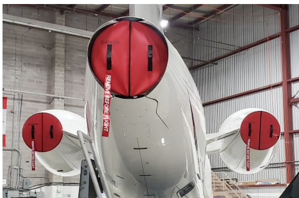
Falcon F7X Exhaust Plugs

The Engine Inlet Plugs are custom fit for your Falcon Jet 7X intakes, made with heavy-duty vinyl material, and stuffed with a single block of sculpted urethane foam. Each plug has a zipper that allows the foam to be removed and dried if necessary. Engine plugs have 'remove before flight' streamers sewn onto the face of the plugs. Most plugs are imprinted with the aircraft registration number in black for an extra charge. Storage bag NOT included. Engine plugs may be inserted after flight when the engine is still warm. Engine Inlet Plugs are commonly referred to as Cowl Plugs, Intake Plugs, Cowl Blocks, Engine Blocks, and Engine Bungs.