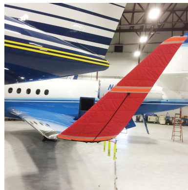
Falcon 2000 Winglet Pad