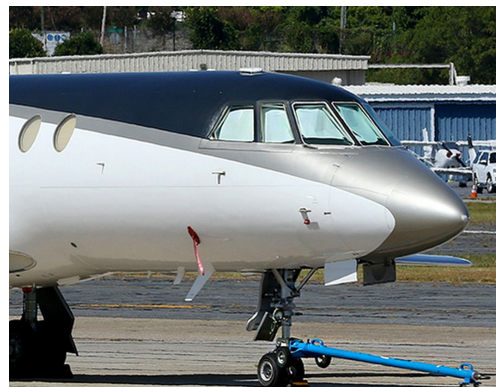
Dassault Falcon 50 Cockpit HeatShields