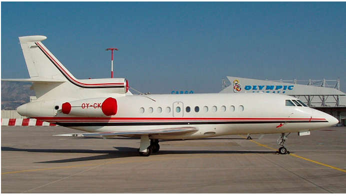
Falcon 900 Engine Covers