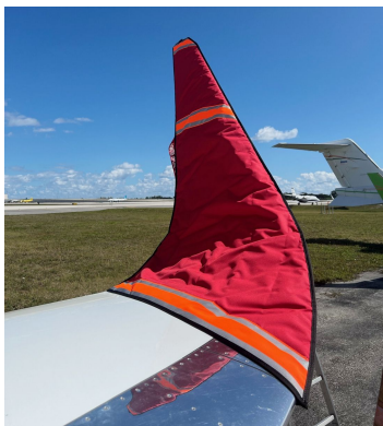
Falcon Jet 900 Winglet Padding Covers