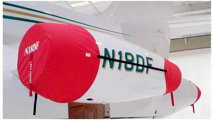
Falcon 900 Engine Cover Set