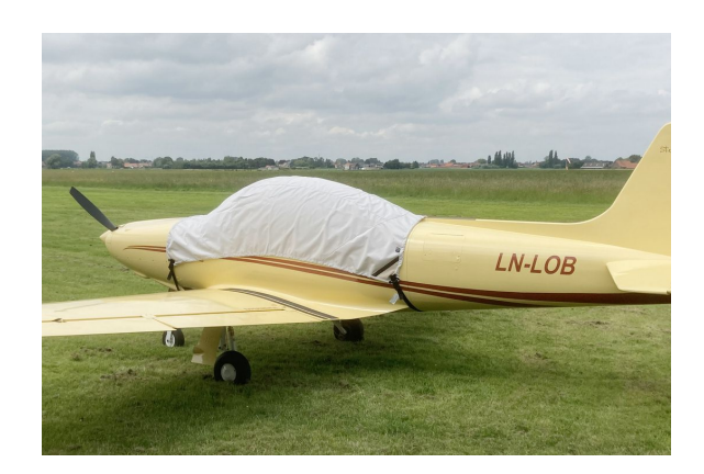
Sequoia Falco Canopy Cover