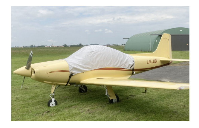
Sequoia Falco Canopy Cover

This cover type is made from Silver Acrylic Sunbrella canvas and is 100% lined with a soft and smooth microfiber. Bruce's Custom Covers developed this material combination especially for aircraft protection. The outer material is medium weight and treated for water resistance, UV resistance and anti-static buildup. The inner lining is a very soft and smooth microfiber to prevent scratching. The material is very reflective, and tests show that the cabin interior temperature can be reduced to near-ambient temperature on the hottest of days. It is water, ice and snow repellent, yet breathable to allow moisture to escape from between the cover and the aircraft surface.