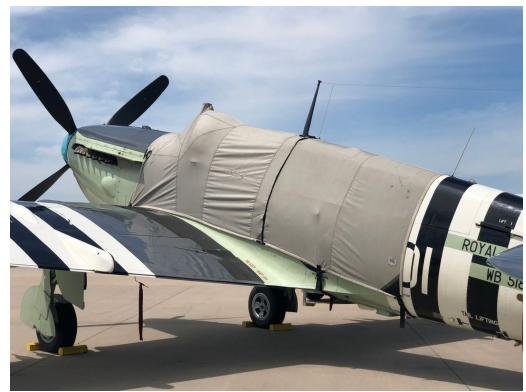
Fairey Firefly Canopy Cover