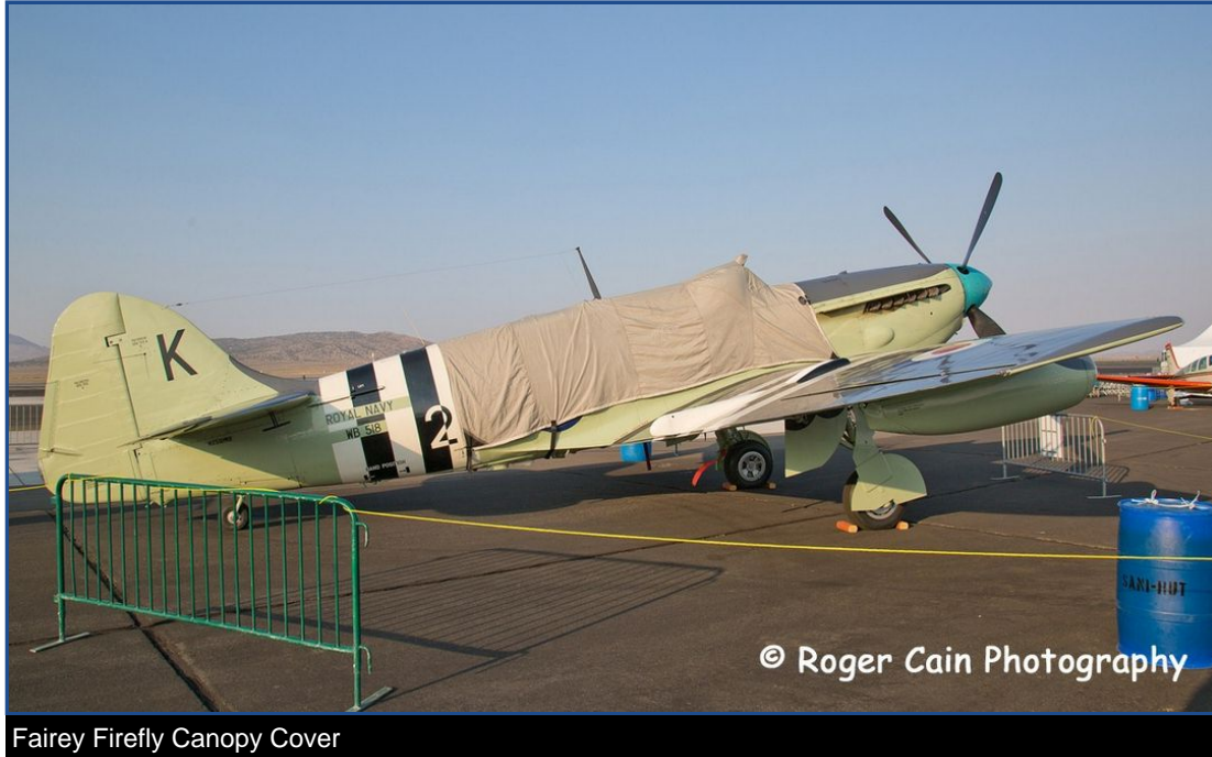
Fairey Firefly Canopy Cover