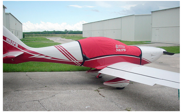
Lightning Canopy Cover