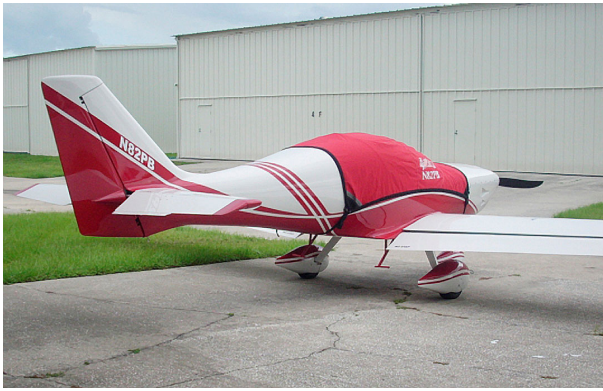
Lightning Canopy Cover