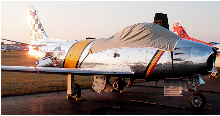
F86 Sabre Canopy Cover