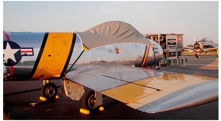
F86 Sabre Canopy Cover