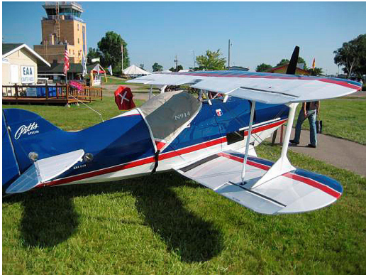
Pitts S-1 Canopy Cover

This cover type is made from Silver Acrylic Sunbrella canvas and is 100% lined with a soft and smooth microfiber. Bruce's Custom Covers developed this material combination especially for aircraft protection. The outer material is medium weight and treated for water resistance, UV resistance and anti-static buildup. The inner lining is a very soft and smooth microfiber to prevent scratching. The material is very reflective, and tests show that the cabin interior temperature can be reduced to near-ambient temperature on the hottest of days. It is water, ice and snow repellent, yet breathable to allow moisture to escape from between the cover and the aircraft surface.