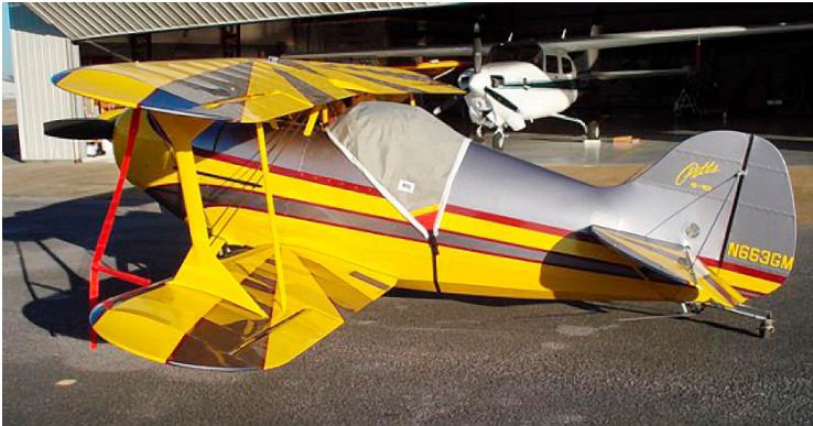
Pitts S1 Canopy Cover

This cover type is made from Silver Acrylic Sunbrella canvas and is 100% lined with a soft and smooth microfiber. Bruce's Custom Covers developed this material combination especially for aircraft protection. The outer material is medium weight and treated for water resistance, UV resistance and anti-static buildup. The inner lining is a very soft and smooth microfiber to prevent scratching. The material is very reflective, and tests show that the cabin interior temperature can be reduced to near-ambient temperature on the hottest of days. It is water, ice and snow repellent, yet breathable to allow moisture to escape from between the cover and the aircraft surface.