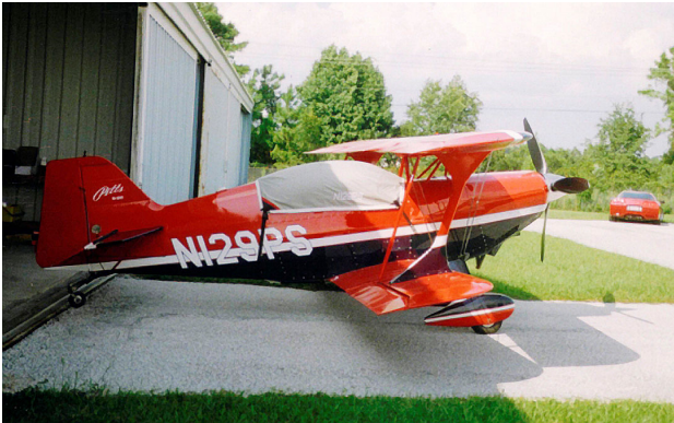
Pitts S2 Canopy Cover