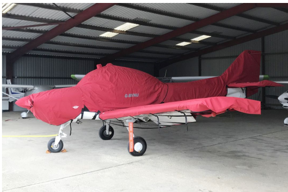
FLS Club Sprint Engine Cover

WINTER USE MATERIAL - Made with Solution-Dyed Polyester fabric, this option is intended for seasonal use to aid in deicing, rain mitigation, or for occasional travel. The material is lighter and more compact, but more susceptible to UV damage and may have a shorter useful life if used continuously outside than the all-year use material.