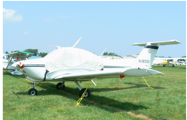
Beech Skipper Canopy Cover, Engine Plugs