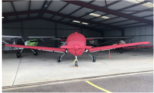
FLS Club Sprint Empennage Cover (Tailboom, Vertical & Horiz Stabilizers) All Year Use