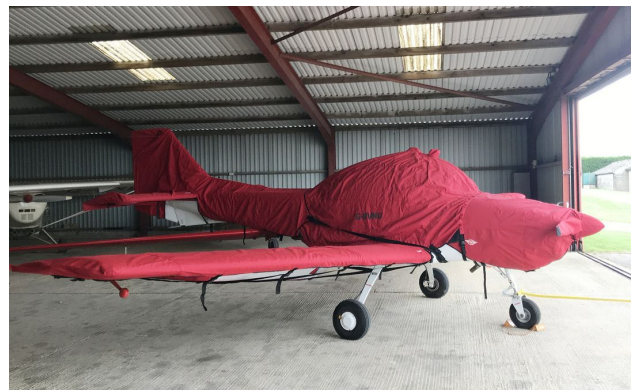
FLS Club Sprint Extended Canopy Cover