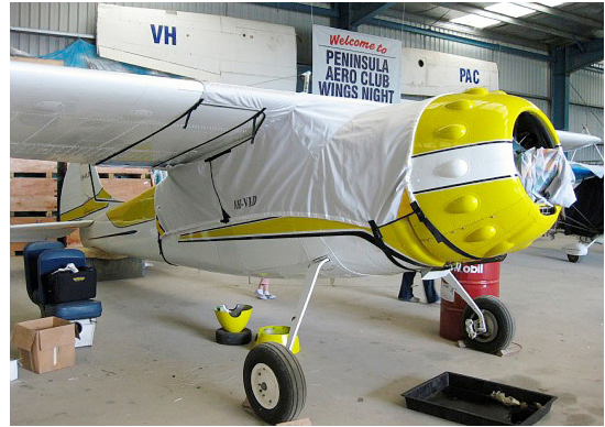
Cessna 195 Canopy Cover, over-top, 24" fwd ext to cover cowl ring gap, gas cap ext.