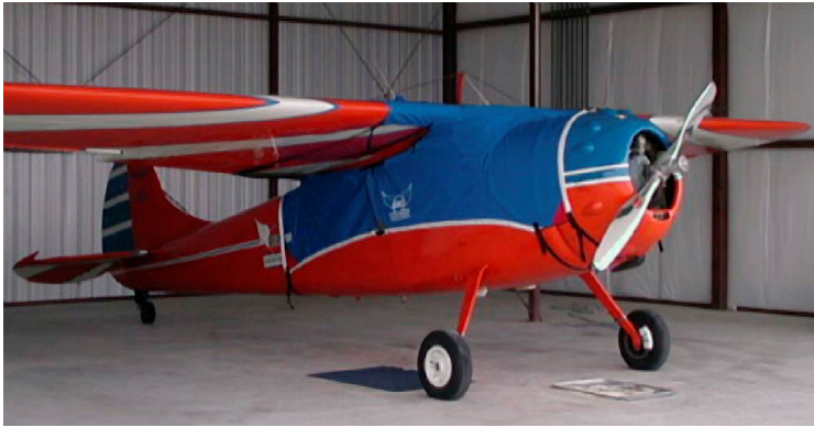
Cessna 195 Canopy Cover, extended forward and over gas caps

The material is very reflective, and tests show that the cabin interior temperature can be reduced to near-ambient temperature on the hottest of days. It is water, ice and snow repellent, yet breathable to allow moisture to escape from between the cover and the aircraft surface.