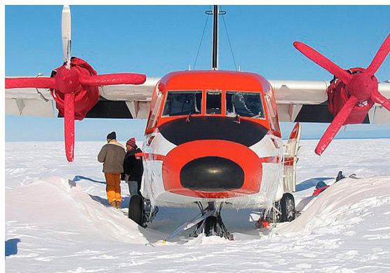
Casa 212 Insulated Engine & Propeller/Spinner Covers