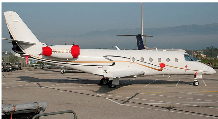
Engine Cover Set