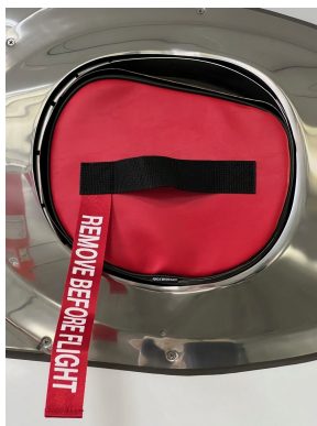
Gulfstream V APU Exhaust Plug

The Engine Inlet Plugs are custom fit for your Gulfstream Aerospace Gulfstream G150 intakes, made with heavy-duty vinyl material, and stuffed with a single block of sculpted urethane foam. Each plug has a zipper that allows the foam to be removed and dried if necessary. Engine plugs have 'remove before flight' streamers sewn onto the face of the plugs. Most plugs are imprinted with the aircraft registration number in black for an extra charge. Storage bag NOT included. Engine plugs may be inserted after flight when the engine is still warm. Engine Inlet Plugs are commonly referred to as Cowl Plugs, Intake Plugs, Cowl Blocks, Engine Blocks, and Engine Bunges.