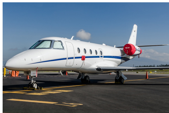
Gulfstream G150 Engine Covers, Cockpit HeatShields