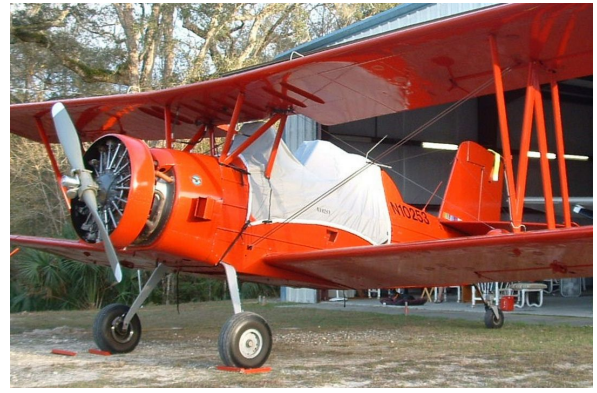
Grumman Ag Cat G-164, Open Cockpit, Canopy Cover