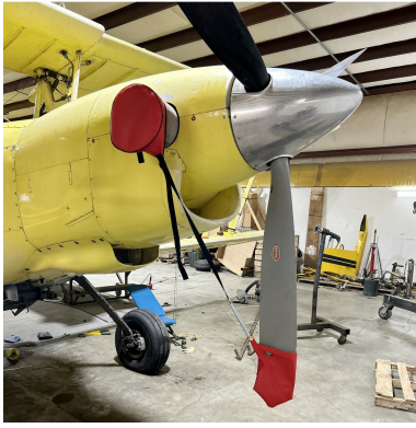
Schweizer Ag-Cat Prop Tie/Exhaust Cover Set