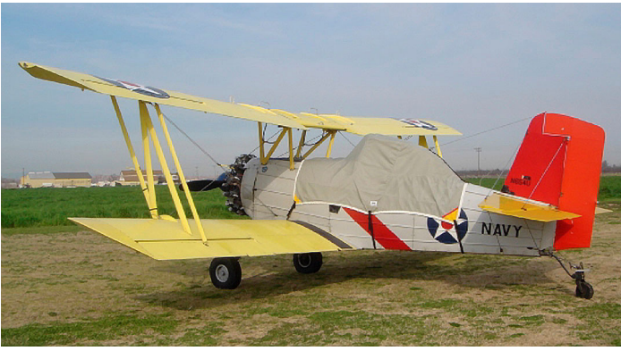
Canopy Cover for the Grumman Ag Cat