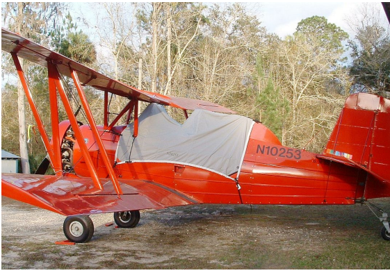
Grumman Ag Cat G-164, Open Cockpit, Canopy Cover