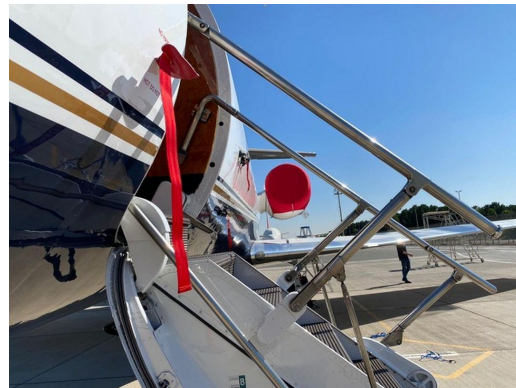
Grumman Gulfstream G-IV SP Pitot Cover