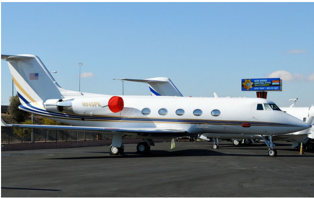
Grumman Gulfstream II Intake Covers

The Gulfstream Aerospace Gulfstream II, III (C-20D) Intake Covers are designed to install easily yet be completely storable. A spring steel hoop is sewn into the hem of each cover, allowing them to be installed without climbing onto the wing or using a stepladder. To store the covers the spring steel hoop folds like a band-saw blade into three nesting rings. Each cover folds into a compact circular bundle which is stored in the included duffle bag, yet they unfold quickly for use. The Tri-Fold Ring cover is made of medium weight nylon which is available in a variety of colors to match the paint trim. Each cover set comes complete with installation and folding instructions. The aircraft's registration number can be silkscreened onto the cover for an extra charge.