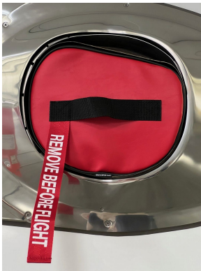
Gulfstream V APU Exhaust Plug

The Engine Inlet Plugs are custom fit for your Gulfstream Aerospace Gulfstream II, III (C-20D) intakes, made with heavy-duty vinyl material, and stuffed with a single block of sculpted urethane foam. Each plug has a zipper that allows the foam to be removed and dried if necessary. Engine plugs have 'remove before flight' streamers sewn onto the face of the plugs. Most plugs are imprinted with the aircraft registration number in black for an extra charge. Storage bag NOT included. Engine plugs may be inserted after flight when the engine is still warm. Engine Inlet Plugs are commonly referred to as Cowl Plugs, Intake Plugs, Cowl Blocks, Engine Blocks, and Engine Bungs.