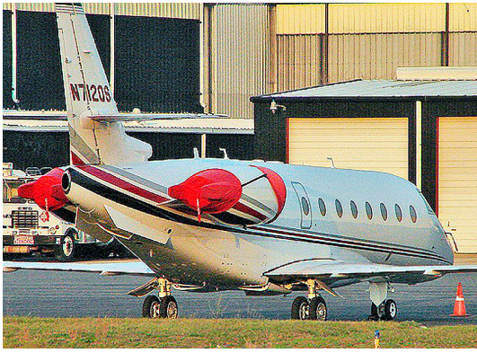
Gulfstream 200 Engine Cover set