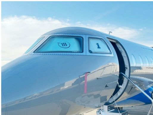
Gulfstream G200 Cockpit Heatshields

Cockpit Heatshields are interior sunshades for the aircraft's cockpit. The product is a unique composite of closed-cell foam with a silver mylar finish. The semi-rigid design is stiff enough to stand inside the window framing. The set folds up flat and is easily stored in the included storage sleeve. Some designs may require velcro and suction cups. Our Heatshields for jets are offered white side out because some aircraft manufacturers have issued advisories against reflective window inserts due to potential heat damage. A Heatshield is an excellent short-term remedy for cockpit overheating, but an external fabric cover is more effective for long-term protection.