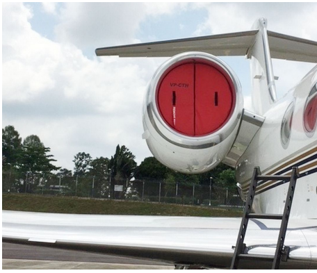
Grumman Gulfstream G450 Intake Plugs