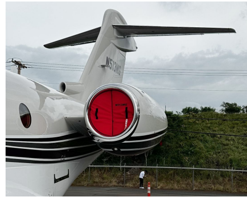
Gulfstream G280 Intake Plugs