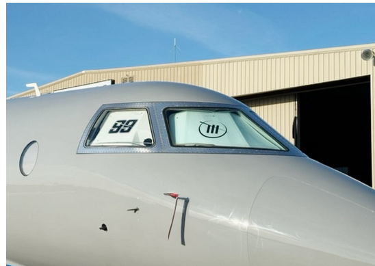
Gulfstream G200 Cockpit Heatshields