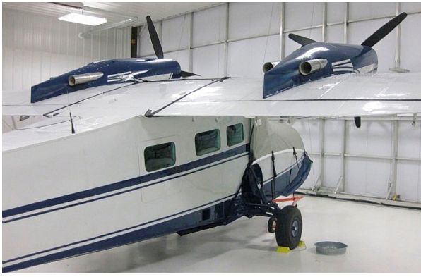
Grumman G44 Widgeon Cockpit/Nose Cover