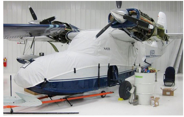
Grumman G44 Widgeon Canopy/Nose Cover