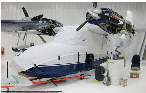
Grumman G44 Widgeon Canopy/Nose Cover