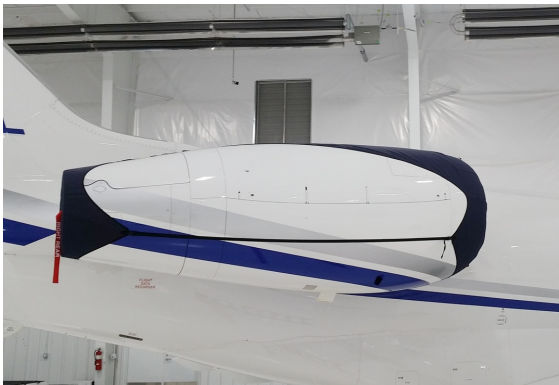
Challenger 300 Intake/Exhaust Cover Set, 3-strap type

The Gulfstream Aerospace Gulfstream IV (C-20G), G350, G450 Intake Covers are designed to install easily yet be completely storable. A spring steel hoop is sewn into the hem of each cover, allowing them to be installed without climbing onto the wing or using a stepladder. To store the covers the spring steel hoop folds like a band-saw blade into three nesting rings. Each cover folds into a compact circular bundle which is stored in the included duffle bag, yet they unfold quickly for use. The Tri-Fold Ring cover is made of medium weight nylon which is available in a variety of colors to match the paint trim. Each cover set comes complete with installation and folding instructions. The aircraft's registration number can be silkscreened onto the cover for an extra charge.