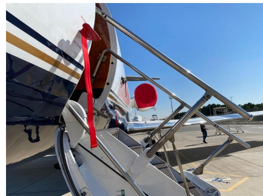
Grumman Gulfstream G-IV SP Pitot Cover