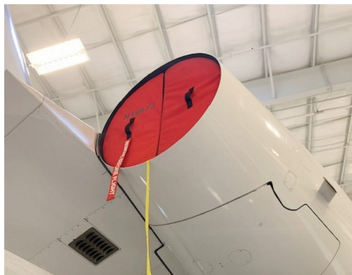
Grumman Gulfstream G-V Exhaust Plugs

The Engine Inlet Plugs are custom fit for your Gulfstream Aerospace Gulfstream IV (C-20G), G350, G450 intakes, made with heavy-duty vinyl material, and stuffed with a single block of sculpted urethane foam. Each plug has a zipper that allows the foam to be removed and dried if necessary. Engine plugs have 'remove before flight' streamers sewn onto the face of the plugs. Most plugs are imprinted with the aircraft registration number in black for an extra charge. Storage bag NOT included. Engine plugs may be inserted after flight when the engine is still warm. Engine Inlet Plugs are commonly referred to as Cowl Plugs, Intake Plugs, Cowl Blocks, Engine Blocks, and Engine Bunges.