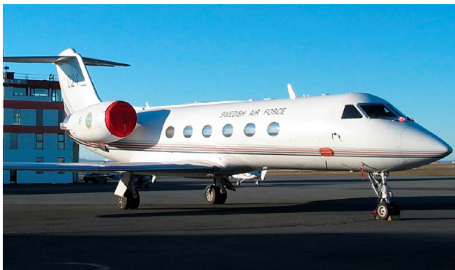
Gulfstream Intake Covers

The Gulfstream Aerospace Gulfstream IV (C-20G), G350, G450 Intake Covers are designed to install easily yet be completely storable. A spring steel hoop is sewn into the hem of each cover, allowing them to be installed without climbing onto the wing or using a stepladder. To store the covers the spring steel hoop folds like a band-saw blade into three nesting rings. Each cover folds into a compact circular bundle which is stored in the included duffle bag, yet they unfold quickly for use. The Tri-Fold Ring cover is made of medium weight nylon which is available in a variety of colors to match the paint trim. Each cover set comes complete with installation and folding instructions. The aircraft's registration number can be silkscreened onto the cover for an extra charge.