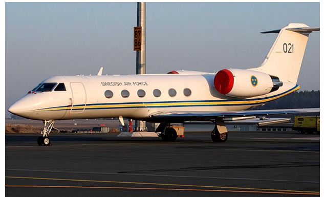
Intake Covers for the Gulfstream