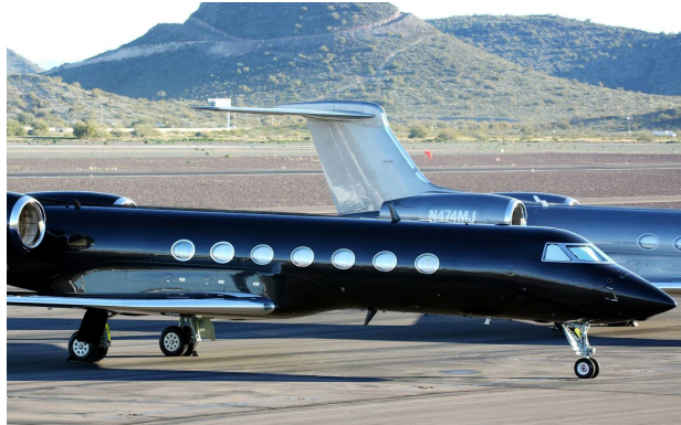
Gulfstream Cockpit Heatshields