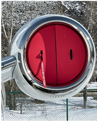
Gulfstream Aerospace Gulfstream GVII (G400,

The Engine Inlet Plugs are custom fit for your Gulfstream Aerospace Gulfstream GVII (G400, G500, G600, G700, G800) intakes, made with heavy-duty vinyl material, and stuffed with a single block of sculpted urethane foam. Each plug has a zipper that allows the foam to be removed and dried if necessary. Engine plugs have 'remove before flight' streamers sewn onto the face of the plugs. Most plugs are imprinted with the aircraft registration number in black for an extra charge. Storage bag NOT included. Engine plugs may be inserted after flight when the engine is still warm. Engine Inlet Plugs are commonly referred to as Cowl Plugs, Intake Plugs, Cowl Blocks, Engine Blocks, and Engine Bungs.