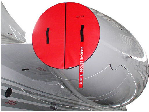
Global Express Exhaust Plugs