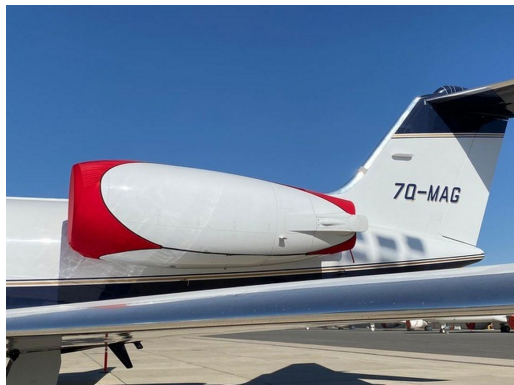
Grumman Gulfstream G-IV SP Engine Cover, bikini type

The Gulfstream Aerospace Gulfstream GVII (G400, G500, G600, G700, G800) Bikini Style Engine Covers are a single-piece design using a soft and smooth stretchy fabric. The cover stretches tightly over both the intake and exhaust, installing quickly and easily. These covers are designed to be used as hangar dust covers and have a useful life of approximately one year.