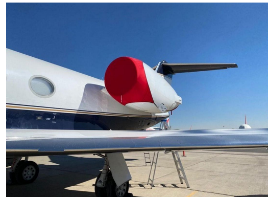
Grumman Gulfstream G-IV SP Engine Cover, bikini type