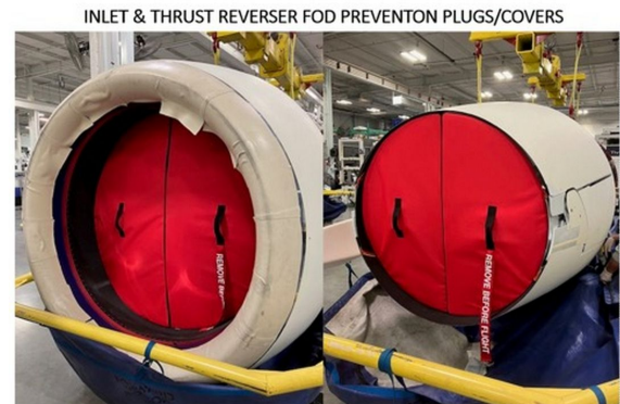
Gulfstream G500 FOD protection plugs for mfg process