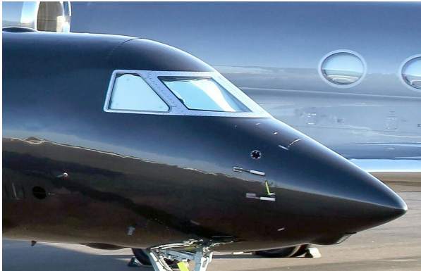
Gulfstream Cockpit Heatshields

Cockpit Heatshields are interior sunshades for the aircraft's cockpit. The product is a unique composite of closed-cell foam with a silver mylar finish. The semi-rigid design is stiff enough to stand inside the window framing. The set folds up flat and is easily stored in the included storage sleeve. Some designs may require velcro and suction cups. Our Heatshields for jets are offered white side out because some aircraft manufacturers have issued advisories against reflective window inserts due to potential heat damage. A Heatshield is an excellent short-term remedy for cockpit overheating, but an external fabric cover is more effective for long-term protection.