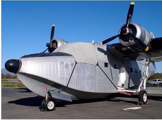
Canopy Cover for the Grumman HU-16 Albatross

Canopy Covers are commonly referred to as Cabin Covers, Fuselage Covers, Canvas Covers, Canopy Caps, etc.