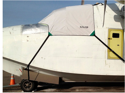
Grumman HU-16 Albatross Canopy Cover