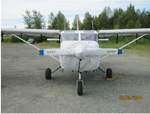
Gippsland GA-8 Airvan Insulated Engine and Prop Covers

This cover type is made from Silver Acrylic Sunbrella canvas and is 100% lined with a soft and smooth microfiber. Bruce's Custom Covers developed this material combination especially for aircraft protection. The outer material is medium weight and treated for water resistance, UV resistance and anti-static buildup. The inner lining is a very soft and smooth microfiber to prevent scratching. The material is very reflective, and tests show that the cabin interior temperature can be reduced to near-ambient temperature on the hottest of days. It is water, ice and snow repellent, yet breathable to allow moisture to escape from between the cover and the aircraft surface.