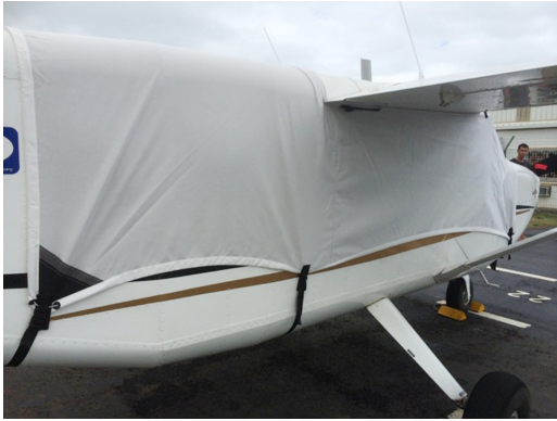
Gippsland GA-8 Airvan Canopy Cover

This cover type is made from Silver Acrylic Sunbrella canvas and is 100% lined with a soft and smooth microfiber. Bruce's Custom Covers developed this material combination especially for aircraft protection. The outer material is medium weight and treated for water resistance, UV resistance and anti-static buildup. The inner lining is a very soft and smooth microfiber to prevent scratching. The material is very reflective, and tests show that the cabin interior temperature can be reduced to near-ambient temperature on the hottest of days. It is water, ice and snow repellent, yet breathable to allow moisture to escape from between the cover and the aircraft surface.