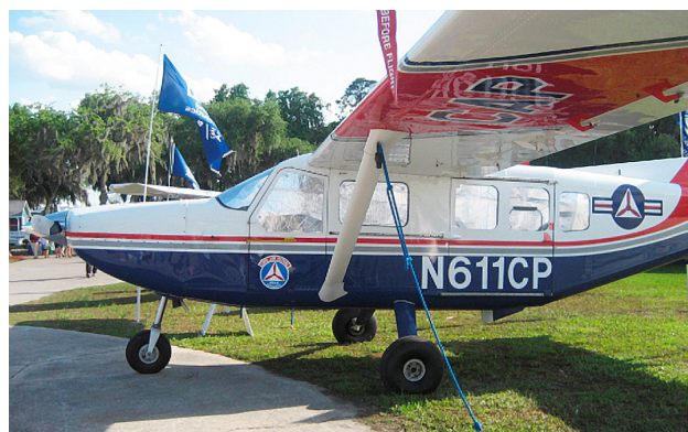
Gippsland GA-8 Airvan Cockpit & Cabin HeatShield Set