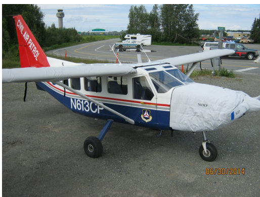
Gippsland GA-8 Airvan Insulated Engine, Wing and Prop Covers

mitigation, or for occasional travel. The material is lighter and more compact, but more susceptible to UV damage and may have a shorter useful life if used continuously outside than the all-year use material.