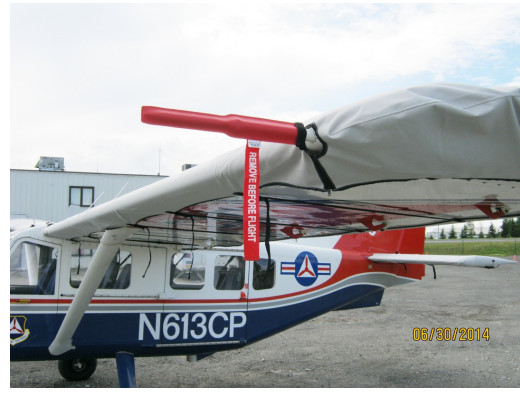
Gippsland GA-8 Airvan Wing Covers, Pitot Cover