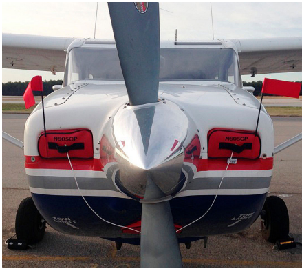
GA-8 Engine Inlet Plugs (set of 3)