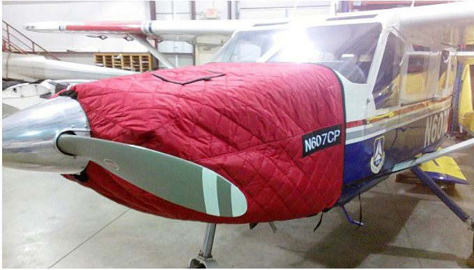
GA-8 Insulated Engine Cover

This cover type is made from Silver Acrylic Sunbrella canvas and is 100% lined with a soft and smooth microfiber. Bruce's Custom Covers developed this material combination especially for aircraft protection. The outer material is medium weight and treated for water resistance, UV resistance and anti-static buildup. The inner lining is a very soft and smooth microfiber to prevent scratching. The material is very reflective, and tests show that the cabin interior temperature can be reduced to near-ambient temperature on the hottest of days. It is water, ice and snow repellent, yet breathable to allow moisture to escape from between the cover and the aircraft surface.