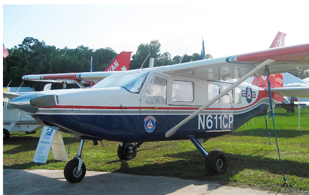
Gippsland GA-8 Airvan Cockpit & Cabin HeatShield Set

Cockpit Heatshields are interior sunshades for the aircraft's cockpit. The product is a unique composite of closed-cell foam with a silver mylar finish. The semi-rigid design is stiff enough to stand inside the window framing. The set folds up flat and is easily stored in the included storage sleeve. Some designs may require velcro and suction cups. A Heatshield is an excellent short-term remedy for cockpit overheating, but an external fabric cover is more effective for long-term protection.