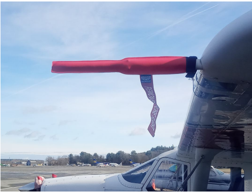
Gippsland GA-8 Airvan Pitot Cover