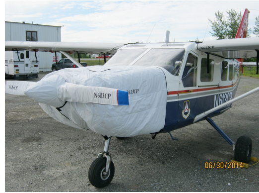
Gippsland GA-8 Airvan Insulated Engine and Prop Covers