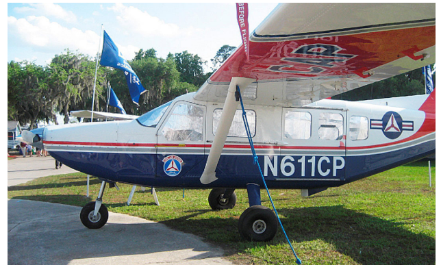
Gippsland GA-8 Airvan Cockpit & Cabin HeatShield Set