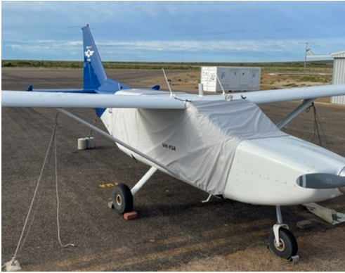
Gippsland GA-8 Extended Canopy Cover

This cover type is made from Silver Acrylic Sunbrella canvas and is 100% lined with a soft and smooth microfiber. Bruce's Custom Covers developed this material combination especially for aircraft protection. The outer material is medium weight and treated for water resistance, UV resistance and anti-static buildup. The inner lining is a very soft and smooth microfiber to prevent scratching. The material is very reflective, and tests show that the cabin interior temperature can be reduced to near-ambient temperature on the hottest of days. It is water, ice and snow repellent, yet breathable to allow moisture to escape from between the cover and the aircraft surface.