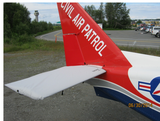
Gippsland GA-8 Airvan Horizontal Stab. Cover