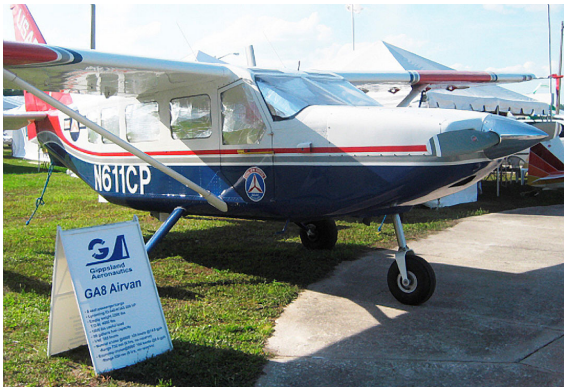
Gippsland GA-8 Airvan Cockpit & Cabin HeatShield Set

Cockpit Heatshields are interior sunshades for the aircraft's cockpit. The product is a unique composite of closed-cell foam with a silver mylar finish. The semi-rigid design is stiff enough to stand inside the window framing. The set folds up flat and is easily stored in the included storage sleeve. Some designs may require velcro and suction cups. A Heatshield is an excellent short-term remedy for cockpit overheating, but an external fabric cover is more effective for long-term protection.