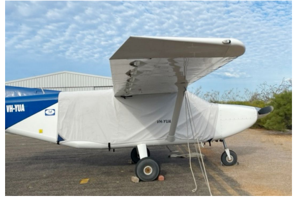
Gippsland GA-8 Extended Canopy Cover