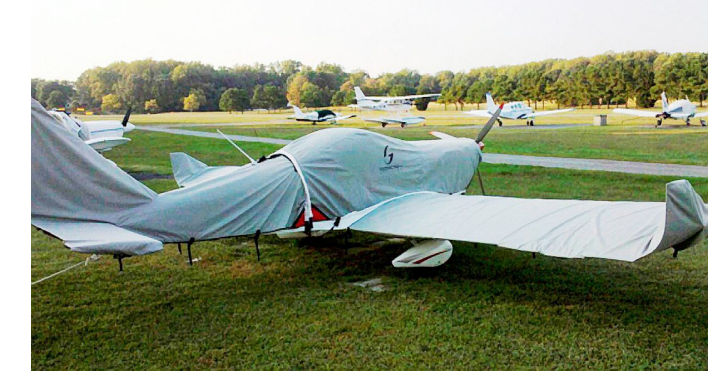
Sting Sport Canopy Cover & Engine Plugs