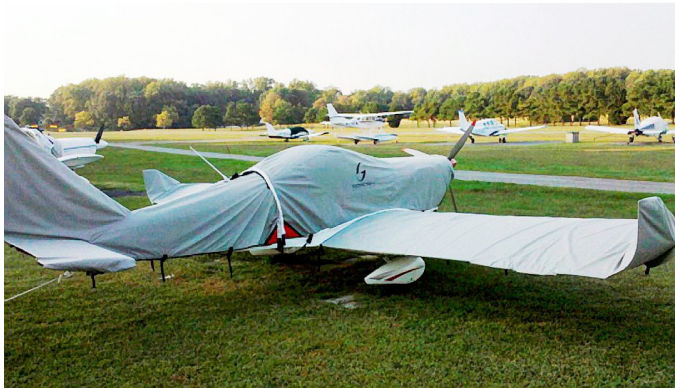
Gobosh Full Cover Set

WINTER USE MATERIAL - Made with Solution-Dyed Polyester fabric, this option is intended for seasonal use to aid in deicing, rain mitigation, or for occasional travel. The material is lighter and more compact, but more susceptible to UV damage and may have a shorter useful life if used continuously outside than the all-year use material.