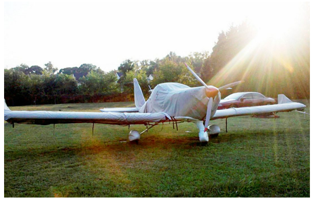
Gobosh Full Cover Set