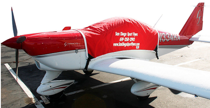
Gobosh Canopy Cover with custom Imprint

This cover type is made from Silver Acrylic Sunbrella canvas and is 100% lined with a soft and smooth microfiber. Bruce's Custom Covers developed this material combination especially for aircraft protection. The outer material is medium weight and treated for water resistance, UV resistance and anti-static buildup. The inner lining is a very soft and smooth microfiber to prevent scratching. The material is very reflective, and tests show that the cabin interior temperature can be reduced to near-ambient temperature on the hottest of days. It is water, ice and snow repellent, yet breathable to allow moisture to escape from between the cover and the aircraft surface.