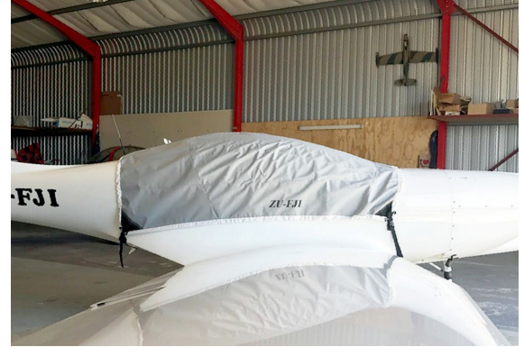
Gobosh 800XP Travel Cover, Light Weight Travel Canopy Cover and Inlet Plugs Gobosh 800XP Travel Cover, Light Weight Travel Canopy Cover