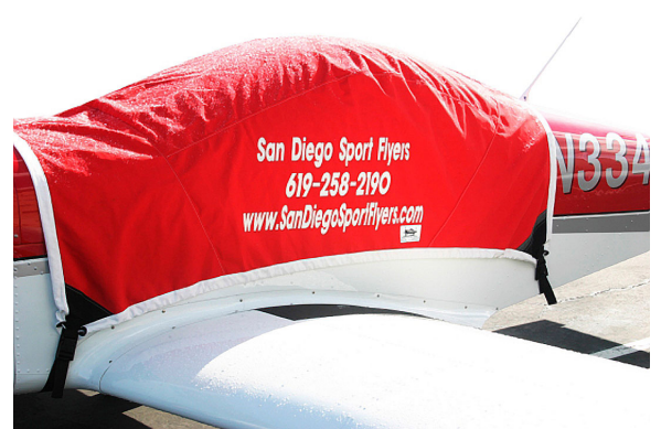
Gobosh Canopy Cover with custom Imprint