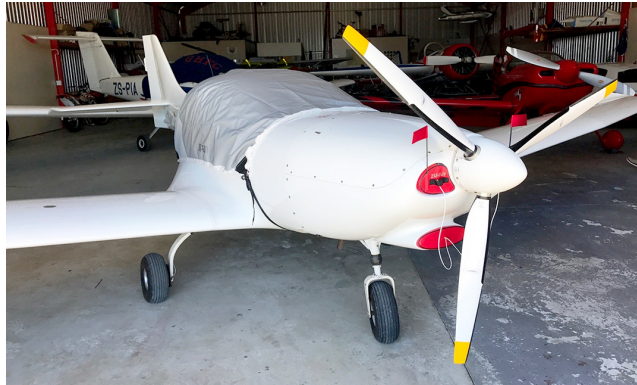
Gobosh 800XP Travel Cover, Light Weight Travel Canopy Cover and Inlet Plugs

Engine Inlet Plugs are custom fit for your Gobosh 800XP intakes, made with heavy-duty vinyl material, and stuffed with a single block of sculpted urethane foam. Each plug has a zipper that allows the foam to be removed and dried if necessary. Engine plugs have warning flags that are visible from the cockpit or 'remove before flight' streamers sewn onto the face of the plugs. Most plugs are imprinted with the aircraft registration number in black for an extra charge. Storage bag NOT included. Engine plugs may be inserted after flight when the engine is still warm. Engine Inlet Plugs are commonly referred to as Cowl Plugs, Intake Plugs, Cowl Blocks, Engine Blocks, and Engine Bung.