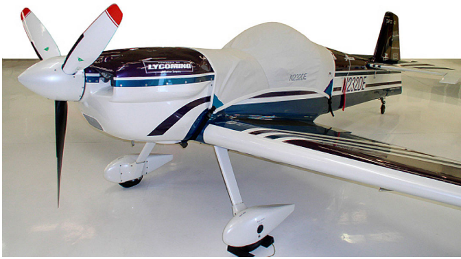
Cap 232 Canopy Cover