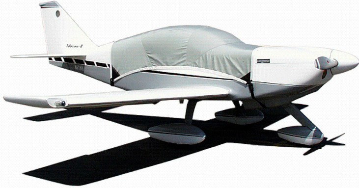
Canopy Cover for the Glasair I

This cover type is made from Silver Acrylic Sunbrella canvas and is 100% lined with a soft and smooth microfiber. Bruce's Custom Covers developed this material combination especially for aircraft protection. The outer material is medium weight and treated for water resistance, UV resistance and anti-static buildup. The inner lining is a very soft and smooth microfiber to prevent scratching. The material is very reflective, and tests show that the cabin interior temperature can be reduced to near-ambient temperature on the hottest of days. It is water, ice and snow repellent, yet breathable to allow moisture to escape from between the cover and the aircraft surface.