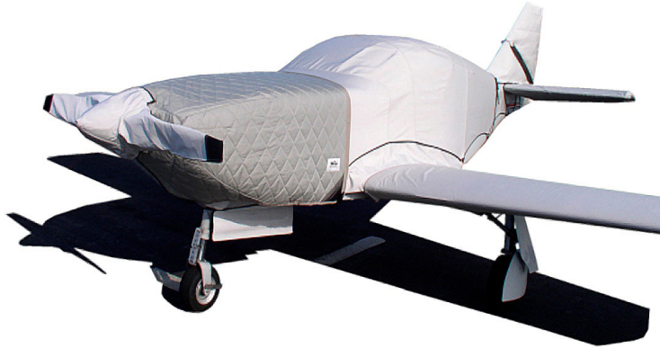
Glasair I Insulated Engine Cover, Prop Cover, Etc.

This cover type is made from Silver Acrylic Sunbrella canvas and is 100% lined with a soft and smooth microfiber. Bruce's Custom Covers developed this material combination especially for aircraft protection. The outer material is medium weight and treated for water resistance, UV resistance and anti-static buildup. The inner lining is a very soft and smooth microfiber to prevent scratching. The material is very reflective, and tests show that the cabin interior temperature can be reduced to near-ambient temperature on the hottest of days. It is water, ice and snow repellent, yet breathable to allow moisture to escape from between the cover and the aircraft surface.