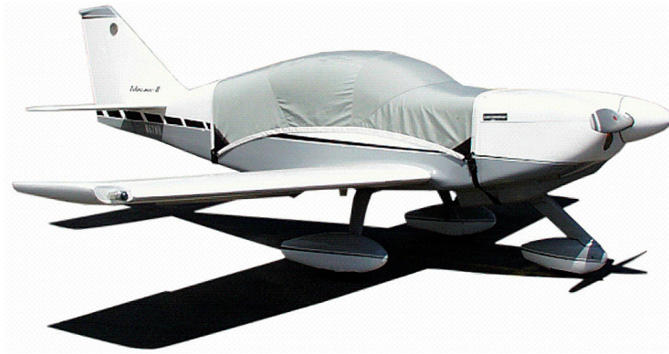
Canopy Cover for the Glasair I

lightweight and more compact for easy stowage in the aircraft. The polyester material is water resistant, but only intended for occasional use outside. We also have an ultra lightweight material available for fitted hangar dust covers. For daily outdoor use, the non-travel Sunbrella Cover is the best choice.