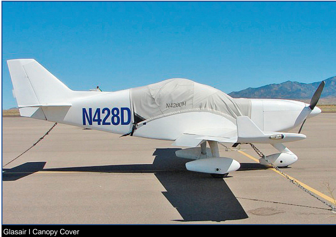
Glasair I Canopy Cover