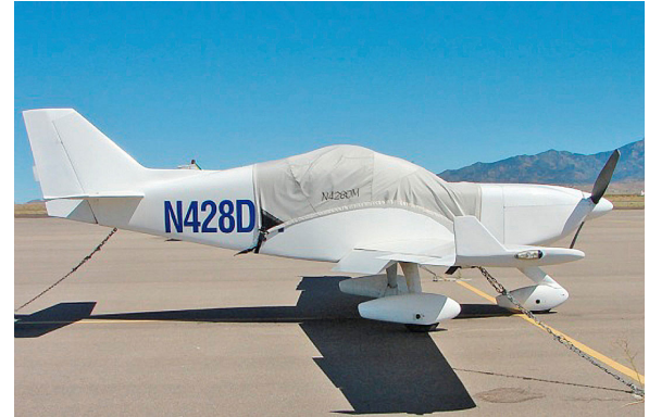
Glasair I Canopy Cover