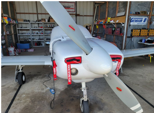
GLASAIR S2-RG Canopy Cover, Engine Plugs