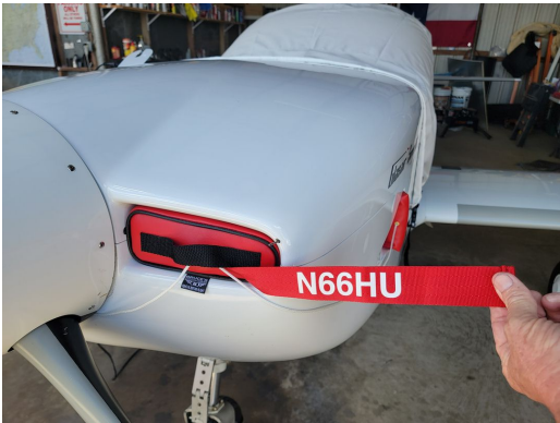
GLASAIR S2-RG Canopy Cover, Engine Plugs