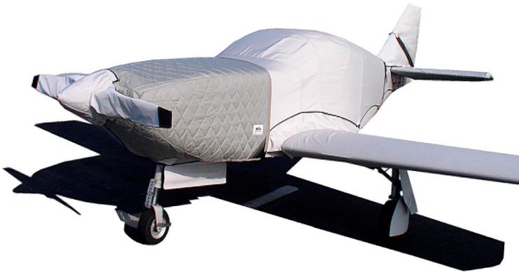
Glasair I Insulated Engine Cover, Prop Cover, Etc.