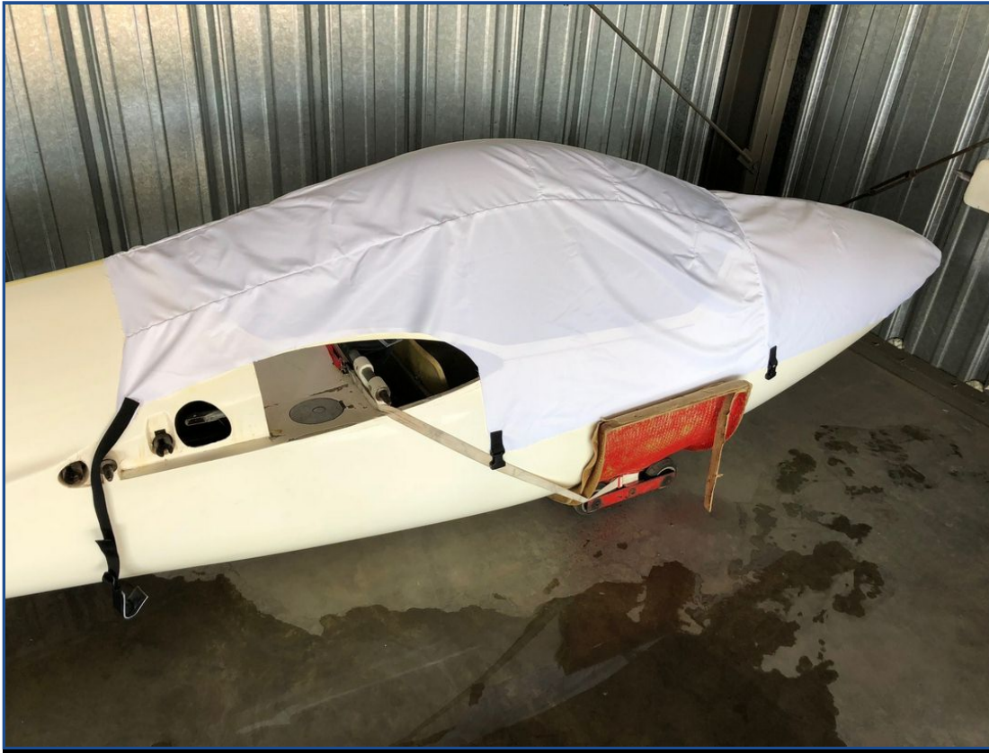
Glasflugel H-301B Libelle Canopy/Nose Cover, test fit cover