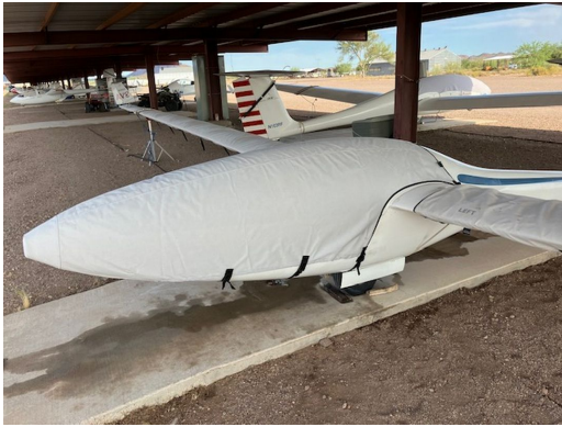
Glasflugel Kestrel Canopy/Nose Cover

water resistance, UV resistance and anti-static buildup. The inner lining is a very soft and smooth microfiber to prevent scratching. The material is very reflective, and tests show that the cabin interior temperature can be reduced to near-ambient temperature on the hottest of days. It is water, ice and snow repellent, yet breathable to allow moisture to escape from between the cover and the aircraft surface.