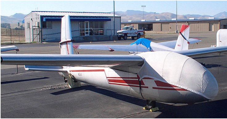
Blanik L13 Canopy/Nose Cover

water resistance, UV resistance and anti-static buildup. The inner lining is a very soft and smooth microfiber to prevent scratching. The material is very reflective, and tests show that the cabin interior temperature can be reduced to near-ambient temperature on the hottest of days. It is water, ice and snow repellent, yet breathable to allow moisture to escape from between the cover and the aircraft surface.