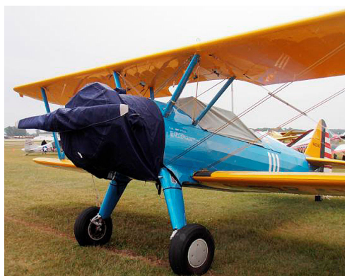
Stearman PT-13 Engine Cover