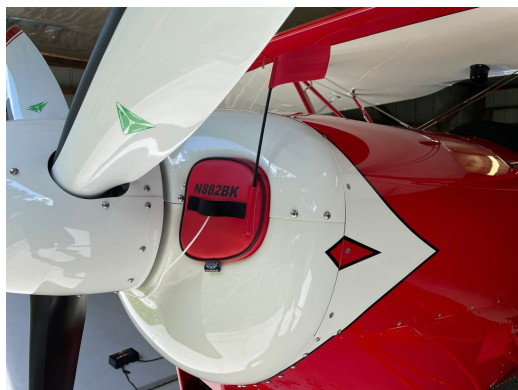
Great Lakes Engine Plugs

Engine Inlet Plugs are custom fit for your Great Lakes Sport Biplane intakes, made with heavy-duty vinyl material, and stuffed with a single block of sculpted urethane foam. Each plug has a zipper that allows the foam to be removed and dried if necessary. Engine plugs have warning flags that are visible from the cockpit or 'remove before flight' streamers sewn onto the face of the plugs. Most plugs are imprinted with the aircraft registration number in black for an extra charge. Storage bag NOT included. Engine plugs may be inserted after flight when the engine is still warm. Engine Inlet Plugs are commonly referred to as Cowl Plugs, Intake Plugs, Cowl Blocks, Engine Blocks, and Engine Bungs.