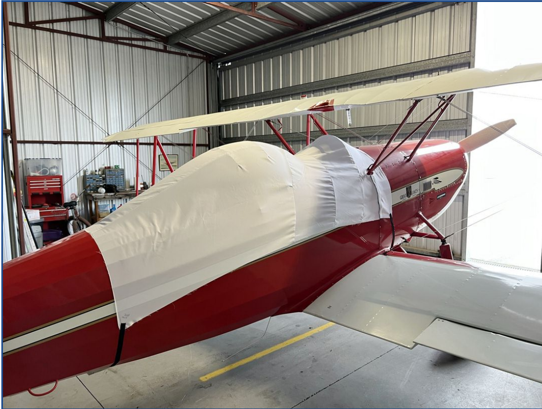
Great Lakes Sport Biplane Canopy Cover, test fit cover