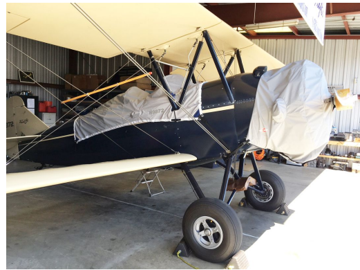
Great Lakes Sport Biplane Canopy Cover, Travel Weight