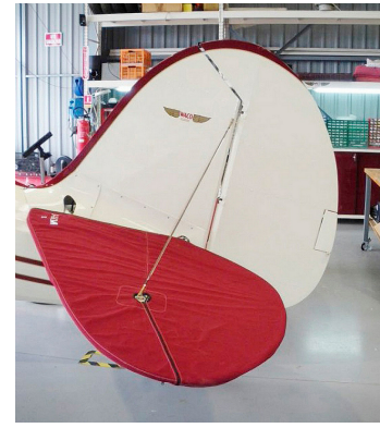
Waco UPF-7 Horizontal Stab. Cover