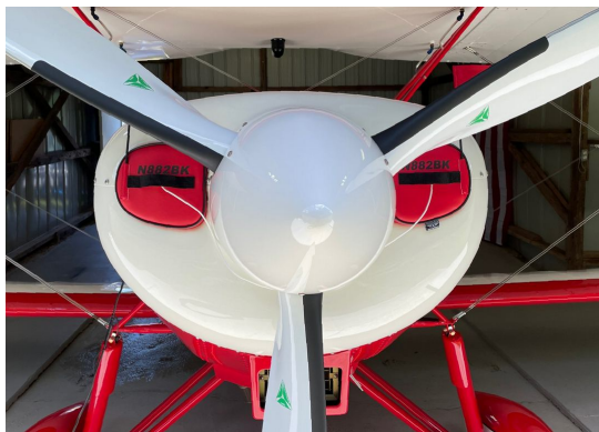
Great Lakes Engine Plugs

Engine Inlet Plugs are custom fit for your Great Lakes Sport Biplane intakes, made with heavy-duty vinyl material, and stuffed with a single block of sculpted urethane foam. Each plug has a zipper that allows the foam to be removed and dried if necessary. Engine plugs have warning flags that are visible from the cockpit or 'remove before flight' streamers sewn onto the face of the plugs. Most plugs are imprinted with the aircraft registration number in black for an extra charge. Storage bag NOT included. Engine plugs may be inserted after flight when the engine is still warm. Engine Inlet Plugs are commonly referred to as Cowl Plugs, Intake Plugs, Cowl Blocks, Engine Blocks, and Engine Bungs.