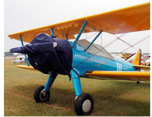
Stearman PT-13 Engine Cover