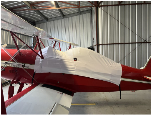
Great Lakes Sport Biplane Canopy Cover, test fit cover