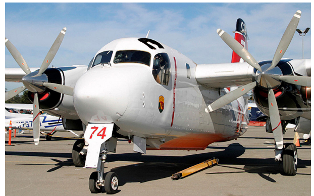
Grumman Tracker Engine Inlet Plugs