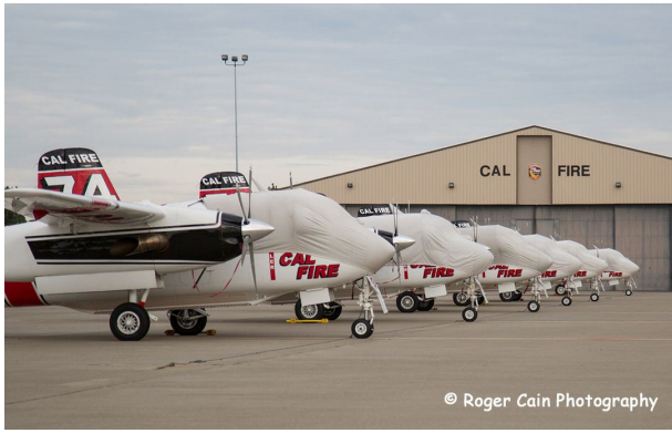
Grumman S-2 Tracker Canopy/Nose Cover