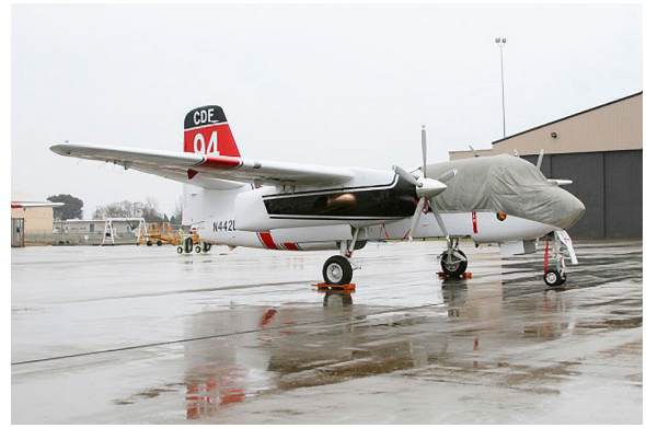
Grumman Tracker Canopy/Nose & Engine Covers