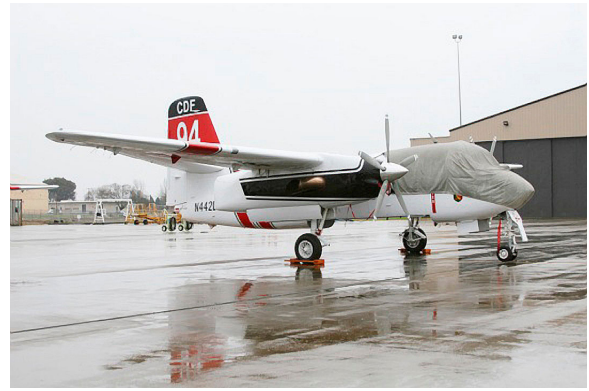
Grumman Tracker Canopy/Nose & Engine Covers