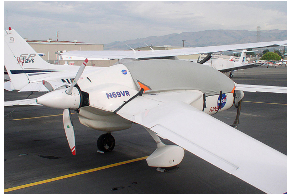
Speed Canard Canopy Cover