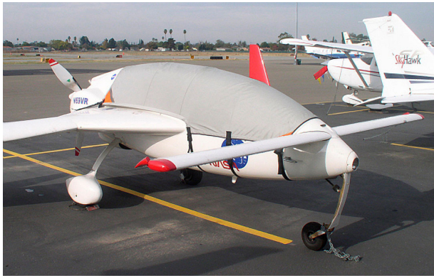
Gyroflug Speed Canard Canopy Cover