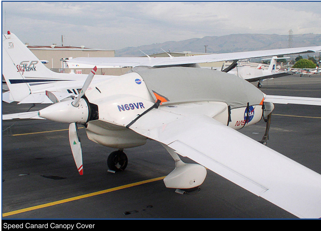
Speed Canard Canopy Cover